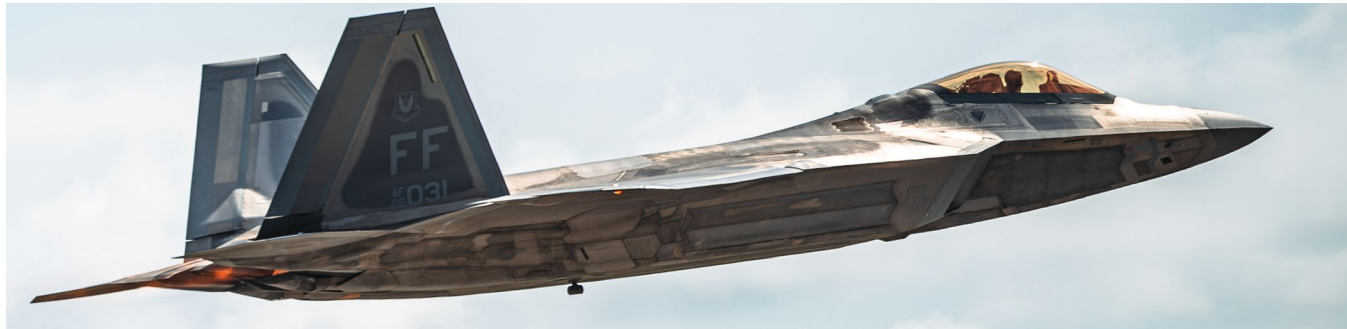
Airman 1st Class Zeeshan Naeem