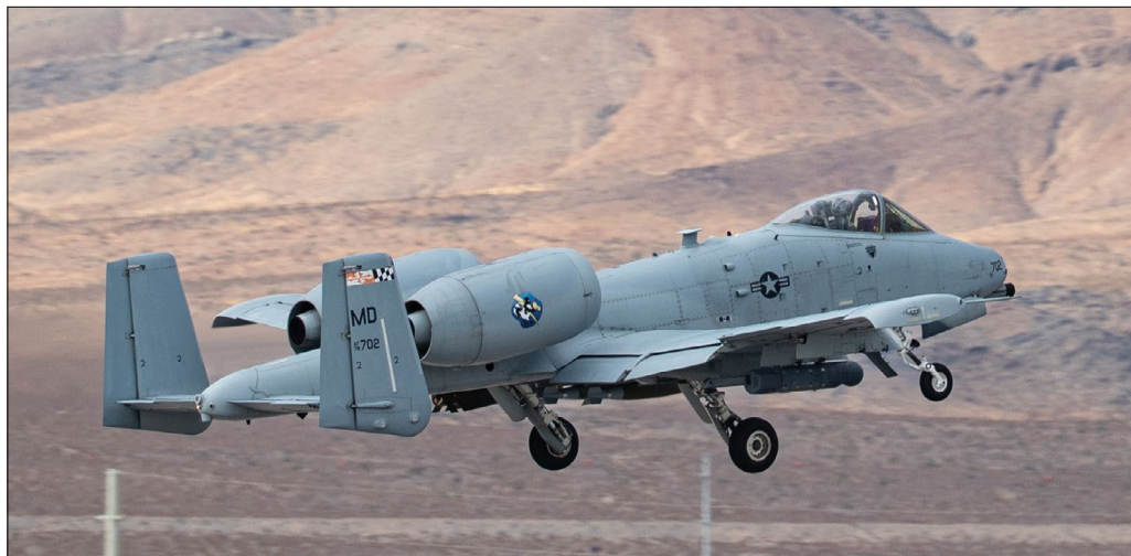
An A-10 Thunderbolt II assigned to the 175th Wing, Maryland Air National Guard (ANG), takes off for a mission in support of the U.S. Air Force Weapons School at Nellis Air Force Base, Nev., Feb. 19, 2025.