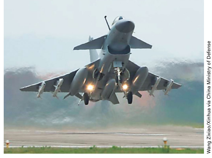
A Chinese J-10 fighter taking off during readiness patrol and military exercises. China's Air Force cannot yet match the survivable kill chains of U.S. fifth-generation aircraft, such as the F-35.

tiveness of any air campaign. Enhancing survivability is key after decades of fighting in largely uncontested battlespace.