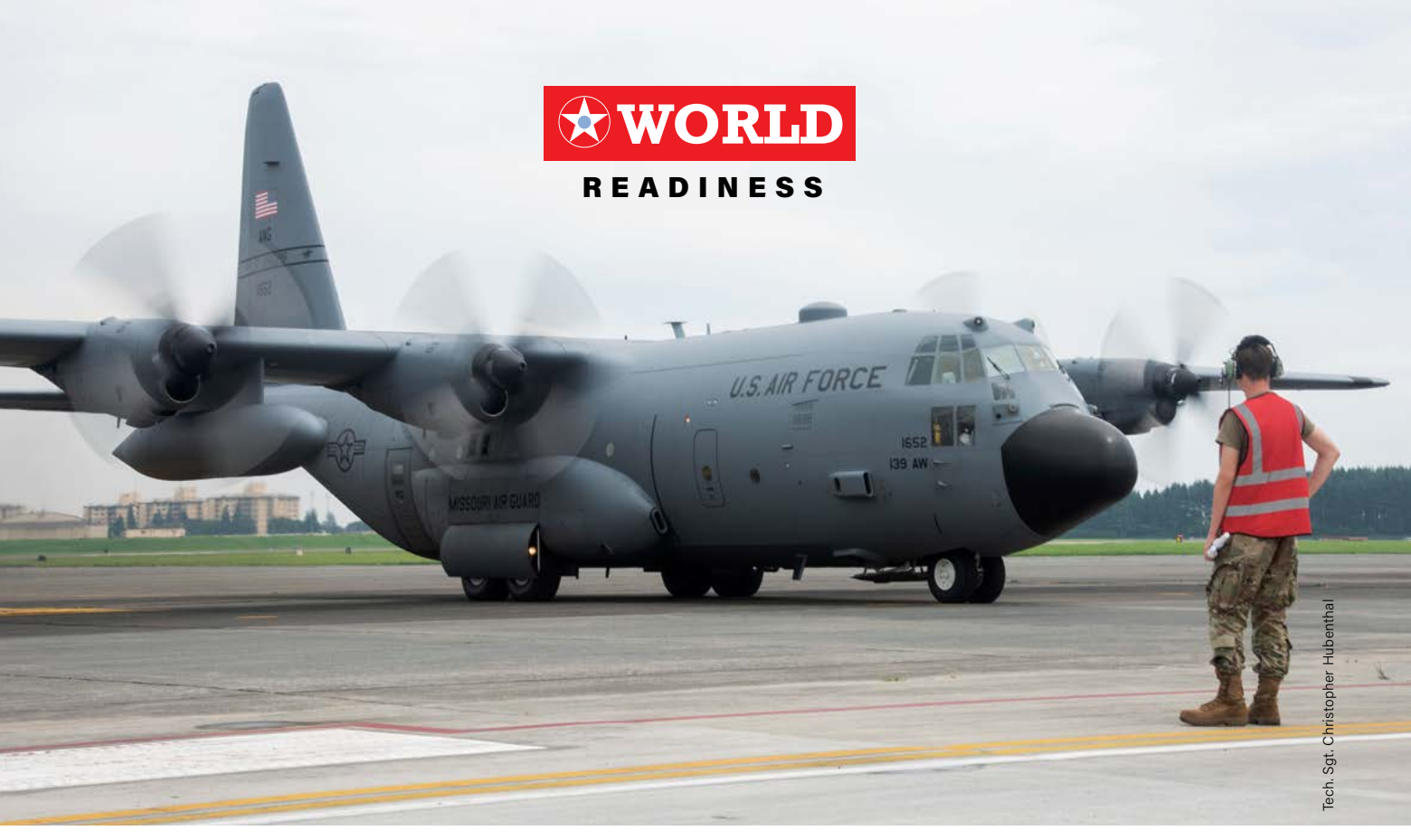
A C-130 Hercules arrives at Yokota Air Base, Japan, in support of Mobility Guardian 2023. The massive mobility air forces exercise spanned the Pacific and included six major allies-Australia, Canada, France, Japan, New Zealand, United Kingdom-in addition to the United States.