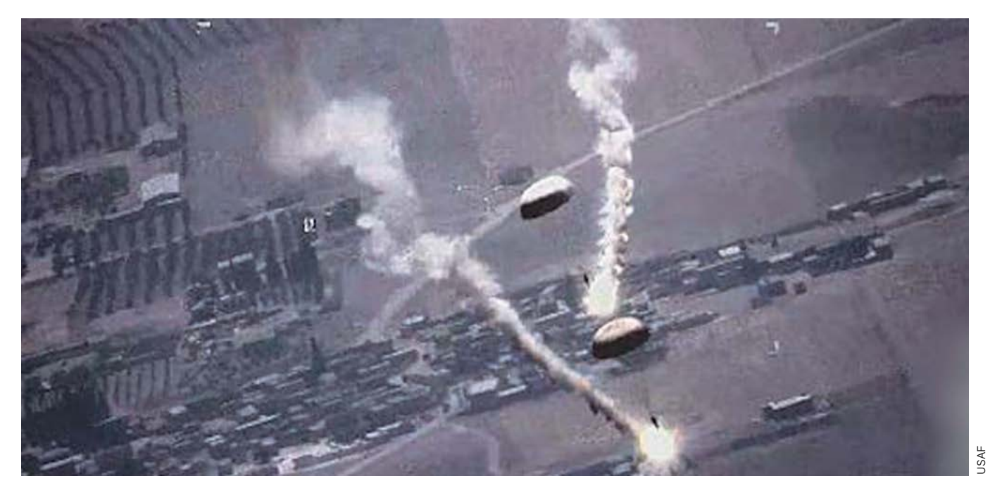
Parachute flares deployed by Russian SU-35 fighters, as photographed by U.S. MQ-9 Reapers on July 5, 2023, over Syria. The Reapers were en route to attacking an ISIS target, flying in Russian controlled airspace. The Russian fighters sought to disrupt the operation, threatening the safety of both U.S. and Russian forces.

currently has around two and a half squadrons of fourth-generation F-16s and F-15Es fighters, as well as A-10s and MQ-9s based in the region.