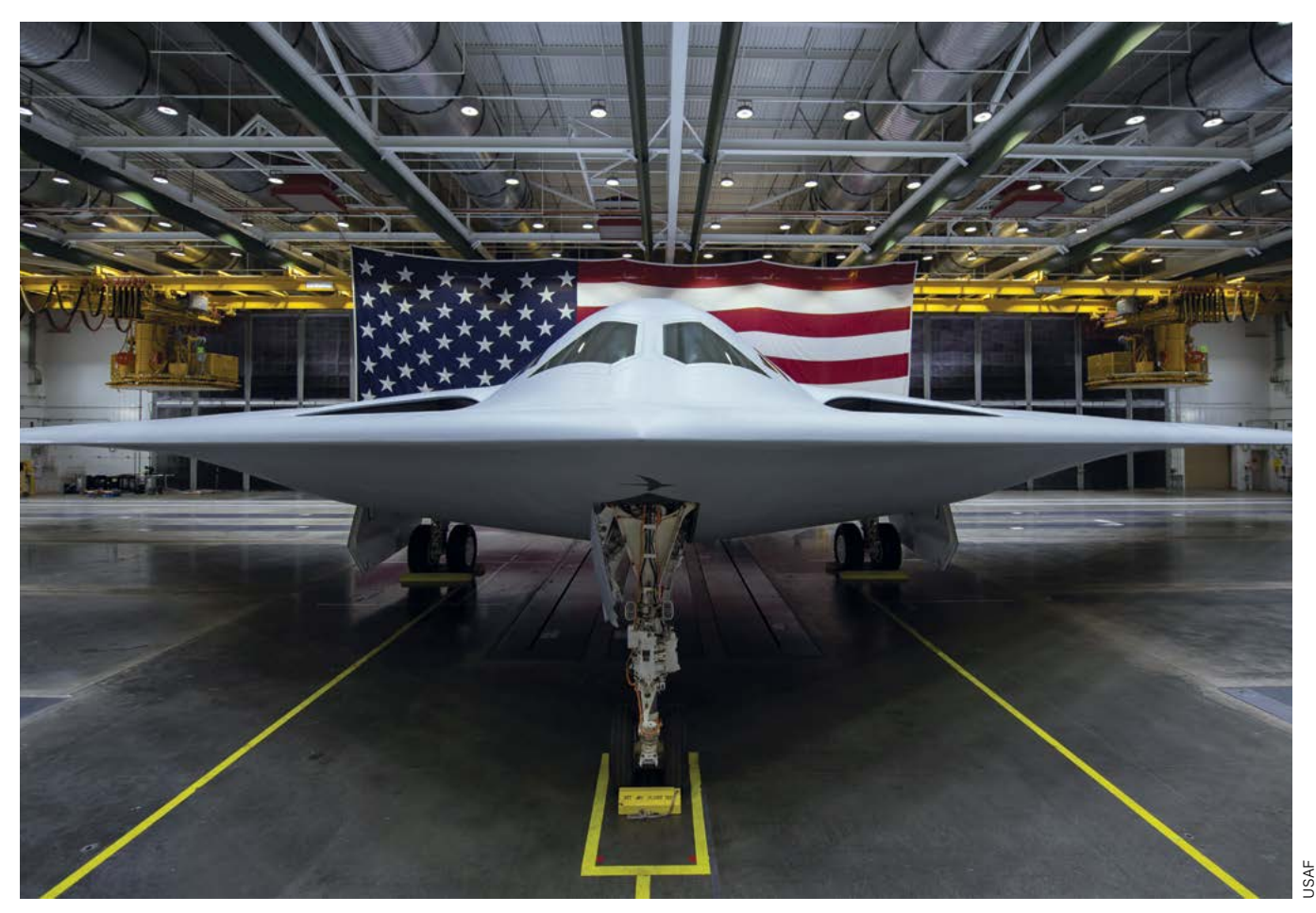
The B-21 Raider represents the next generation of global strike for the Air Force. Unveiled in December 2022, the new stealth bomber is smaller than the B-2 it resembles while incorporating a host of advanced stealth and related features.