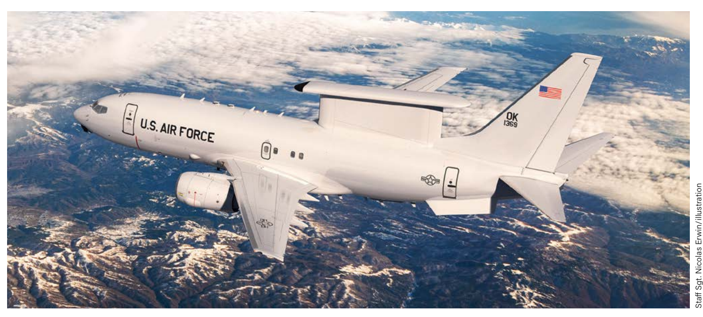
The E-7A, as shown in this illustration, will replace the E-3 Sentry Airborne Warning and Control System (AWACS). The U.S. is working with Australia, Britain, and Boeing to accelerate the program.