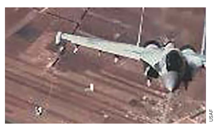
Drone view of the Russian SU-35 fighter aircraft closing in on a U.S. MQ-9 aircraft on July 5 over Syria, in what Air Force officials call unsafe and unprofessional actions.

Grynkewich said Russia should honor its agreements and operate in a more responsible way over Syria.