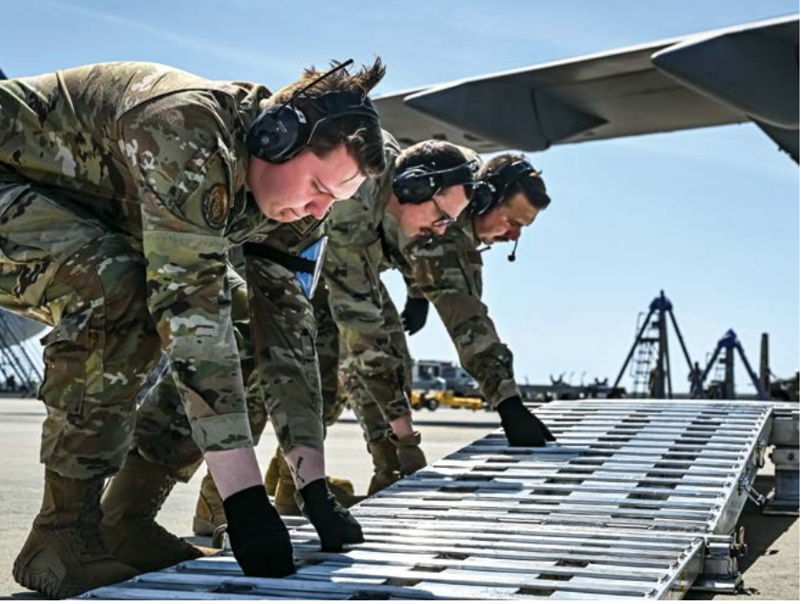
Air Transportation Specialists with the 305th Aerial Port Squadron prepare an upload for a C-17 Globemaster at Joint Base McGuire-Dix-Lakehurst, N.J.

Source: U.S. Air Force Total Aircraft Inventory (TAI) as of Sept. 30, 2022