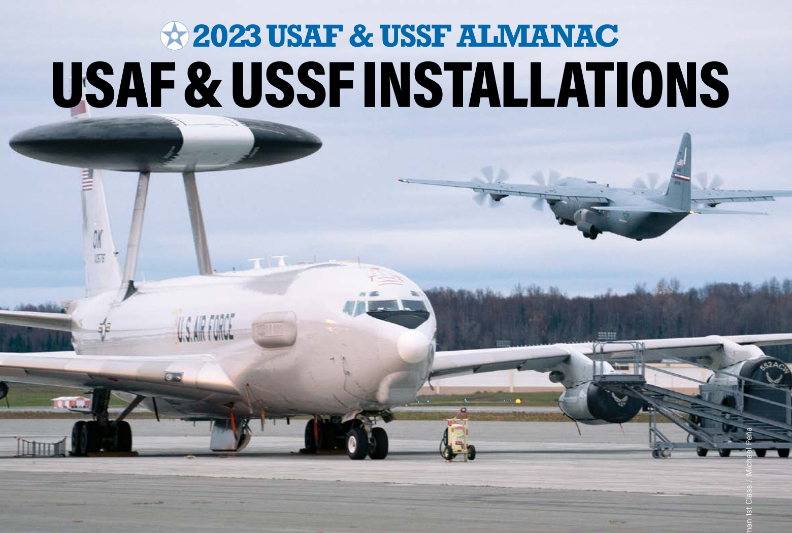
A C-130J Super Hercules takes off past an E-3 AWACS at Joint Base Elmendorf-Richardson, Alaska.