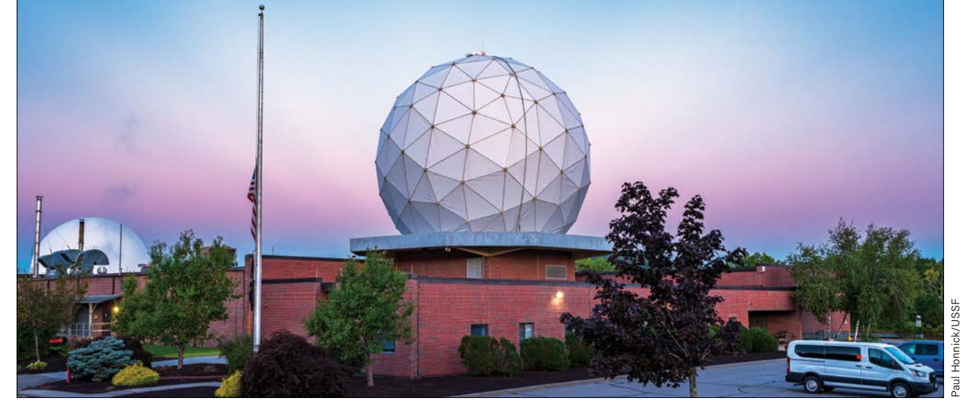
Dawn at New Boston Space Force Station, N.H. The 23rd Space Operations Squadron provides satellite command and control.