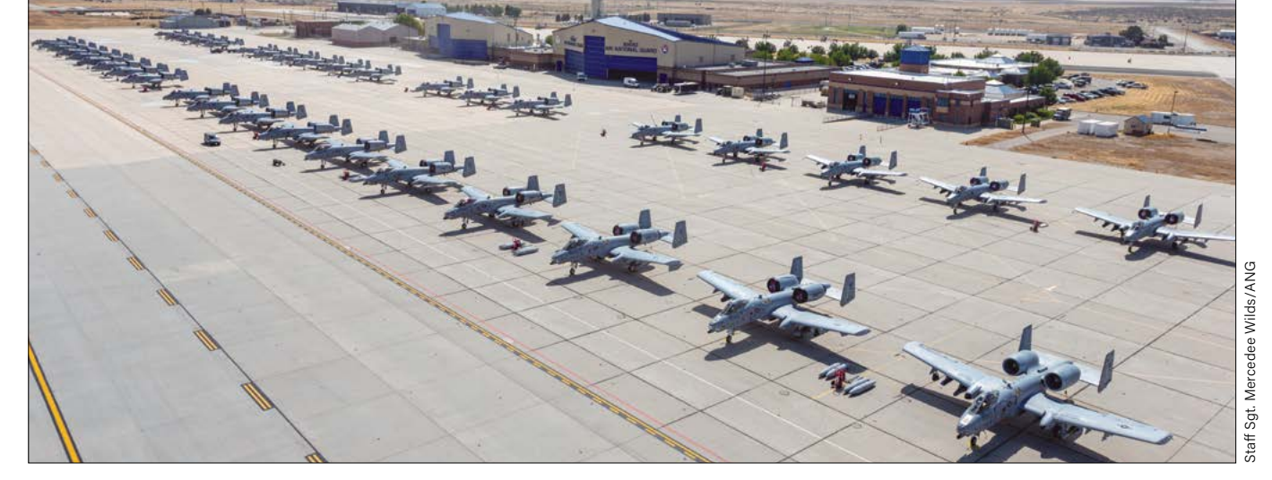
Thirty-seven A-10 Thunderbolt II's sit on the flight line at Gowen Field, in Boise, Idaho.

■Tyndall AFB, Fla. 32403. Nearest city: Panama City. Phone: 850-282-1110. Acres: 28,891. Total Force: civilian, 2,709; military, 2,723. Active-duty USAF: enlisted, 1,738; officer, 415. Active-duty USSF: enlisted, 0; officer, 2. Owning command: ACC. Unit/mission: 53rd WEG (ACC), T&E; 101st AOG (ANG), C2 operations; 325th FW (ACC), 325th FW associate unit (ANG), training; 601st AOC (ACC/ANG), plan/direct air operations; Air Force Rescue Coordination Center (ACC), plan/ direct inland rescue operations; Hg. Continental U.S. NORAD Region (NORAD)/1st Air Force (Air Forces Northern) (ACC/ANG), operational leadership. History: Activated Dec. 7, 1941. Named for 1st Lt. Frank B. Tyndall, WWI fighter pilot killed July 15, 1930. Inn: 850-283-4210. Golf: Pelican Point.