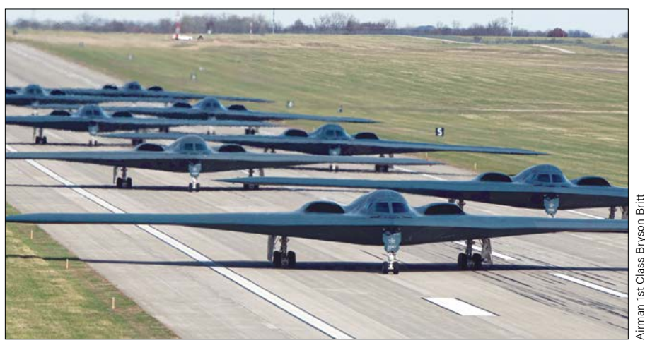
B-2 Spirit stealth bombers during exercise Spirit Vigilance at Whiteman Air Force Base, Mo.