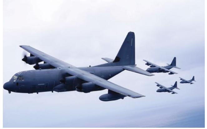
MC-130J COMMANDO II

masters. Load: 77 troops, 52 paratroops, or 57 litters.