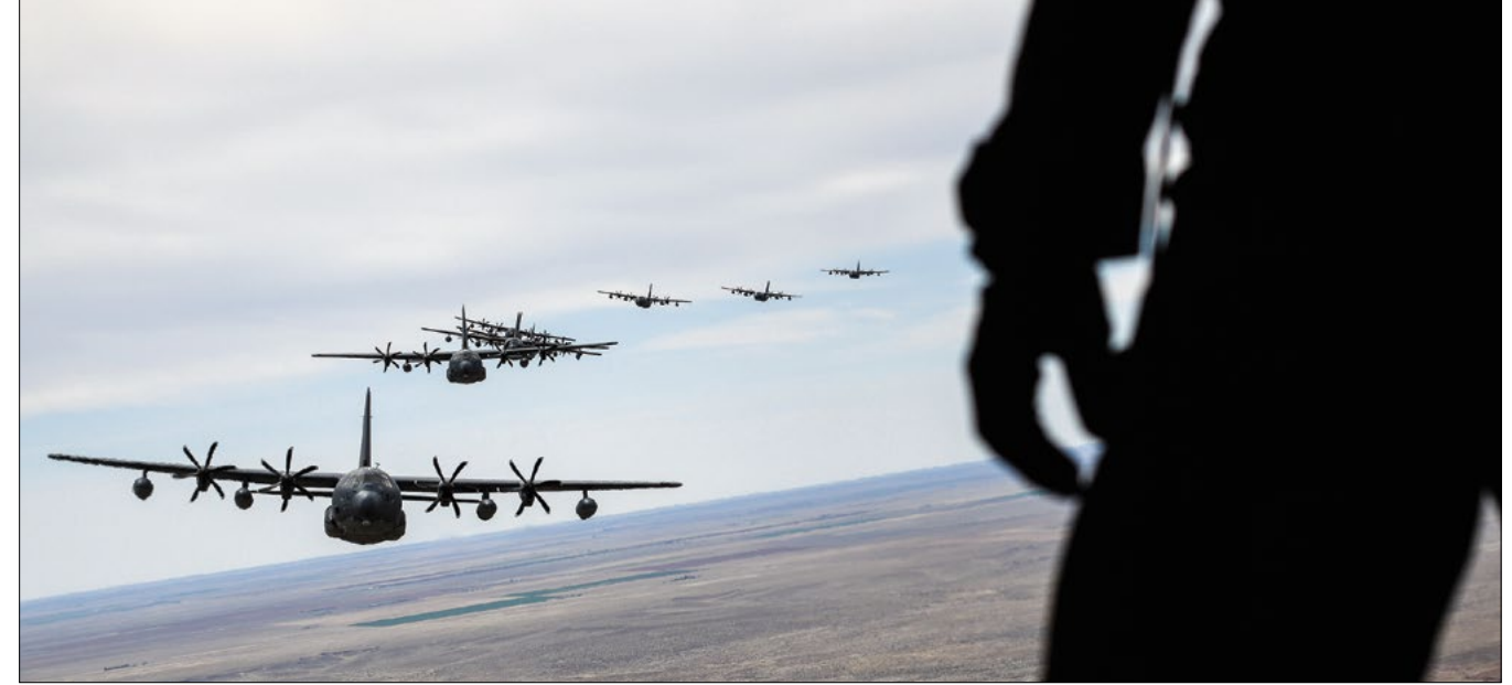
A loadmaster watches a formation of MC-130Js from Cannon Air Force Base, N.M.

■ New Boston AFS , N.H. 03070. Nearest city: New Boston. Phone: 719-567-5040. Acres: 2,873. Total Force: 39. Component: USSF. Unit/mission: 23rd Space Operations Squadron, satellite command and control. History: Began as a research-and-development facility in 1960 with van-mounted