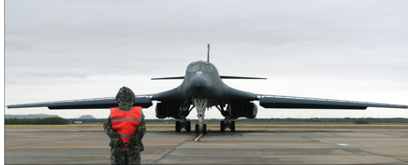
Tech. Sgt. Tory Patterson

■ Portland ANGB , Portland Intl. Airport, Ore. 97218. Nearest city: Portland. Phone: 503-335-4104. Acres: 222. Total Force: 1,728. Component: ANG/AFRC. Unit/mission: 123rd WF (ANG), combat weather operations; 125th STS (ANG), special tactics operations; 142nd FW (ANG), fighter operations; 304th RQS (AFRC), personnel