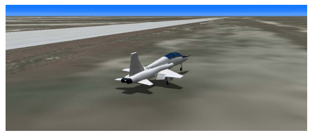
Figure 3 - Aircraft Touchdown in Grass (Tab Z-7)

At 19:24:03.2, as the aircraft reached its maximum pitch, MIP1 commanded ejection (Tab DD-19). Simultaneously, the MA reached full aerodynamic stall and rolled to the right as the nose dropped (Tab DD-19). The MA angle of attack indicates that MIP1 released the stick as he finished commanding ejection approximately one second later (Tab DD-19). Figure 4 shows the parameters of the aircraft at 19:24:04.9, immediately prior to ejection and impact, with a slightly nose low attitude, 45 degrees of right bank, a descent rate of 500 feet per minute, and an airspeed of 147 knots (Tabs Z-8 and DD-19). The MC initiated ejection (Tab J-25). MIP2 successfully ejected and sustained minor injuries (Tab J-25). However, impact interrupted MIP1's ejection sequence after the canopy departed but before the forward seat ejected (Tab J-25 and J-40).