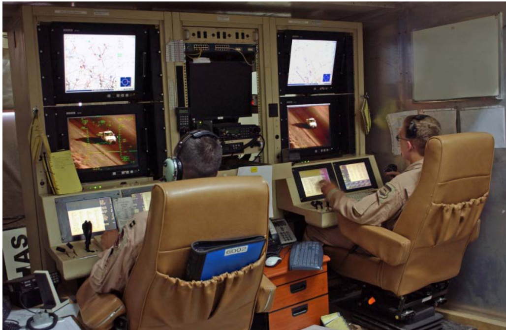
Figure 2. Inside View of Ground Control Station (Tab CC-3)

The basic crew for the Predator consists of a pilot to control the aircraft and command the mission and an enlisted aircrew member to operate sensors and weapons plus a mission coordinator, when required. The crew employs the aircraft from inside a GCS via a line-of-sight data link or a satellite data link for beyond line-of-sight operations. The MQ-1B carries the Multi-spectral Targeting System, or MTS-A, which integrates an infrared sensor, a color/monochrome daylight television (TV) camera, an image-intensified TV camera, a laser designator and a laser illuminator into a single package. The full motion video from each of the imaging sensors can be viewed as separate video streams or fused together. The aircraft can