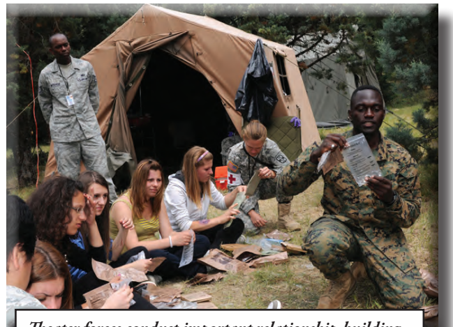
Theater forces conduct important relationship-building events through EUCOM's Partnership-for-Peace program, preserving and strengthening our strategic partnerships.

When it comes to our overseas footprint, European Command will continue to review requirements across our mission, quality of life, and agency portfolios in order to work towards joint solutions and achieve infrastructure efficiencies, particularly as Departmental leadership, in accordance with the new strategic guidance, considers the appropriate size and composition of U.S. forces in Europe. As we continue these consolidation and recapitalization efforts, we will convey our requirements in our Theater Posture Plan and military construction requests.