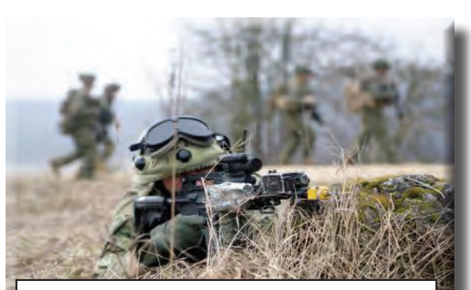
A Georgian soldier receives training through the Marine Forces Europe Georgia Deployment Program. The phase of training shown above was conducted at the Joint Multinational Training Center, Germany.

Georgia Deployment Program—International Security Assistance Force. In support of nationally directed theater strategic end states, Marine Forces Europe leads European Command's joint mission to train the Georgian Armed Forces. Executing this mission since 2010, Marine Forces Europe has developed and implemented a program that has trained and deployed a total