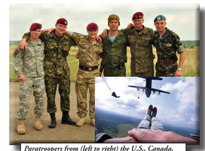
Paratroopers from (left to right) the U.S., Canada, the U.K., Belarus, Poland and Ukraine join together for a photograph to commemorate RAPID TRIDENT 2011, a first-of-its-kind multinational airborne exercise designed to promote regional stability and security, strengthen international military partnering, foster trust, and improve interoperability among participating nations. RAPID TRIDENT 2011 was led by U.S. Army Europe, and conducted at the International Peacekeeping and Security Center in Yavoriv, Ukraine.

RAPID TRIDENT assembled 1,600 forces from 13 countries to conduct the first-ever multinational airborne drop into Ukraine, developing important land warfare skills and camaraderie among key NATO and non-NATO partners in a critical area of the world. JACKAL STONE 11, Special Operations Command Europe's annual capstone exercise, involved eight nations and over 1,500 partner nation Special Operations Forces (SOF) sharpening theater SOF capabilities in all