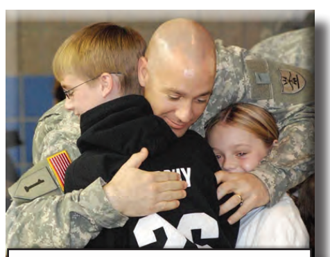
"We must preserve the quality of our All-Volunteer Force and not break faith with our men and women in uniform or their families."

Investment in Our Schools. We are pleased that the Department of Defense Education Activity (DoDEA) continues to make needed investments in DoDEA's overseas school infrastructure. Many of our schools are converted 1950s-era barracks. These investments directly