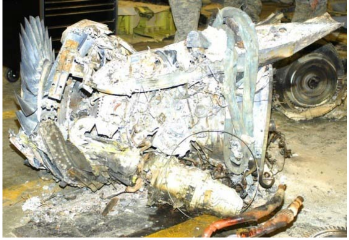
Figure 2. Engine #1

a. Engine #1, TF34-100A, Serial Number (S/N) GE00206265