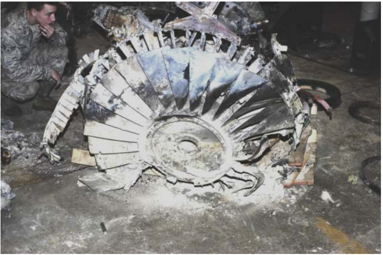
Figure 7. Engine #2

Engine #2 ( See Figure 7) s uffered e xtensive d amage in the crash, but w as not e xposed t o temperatures as high as Engine #1. All iron components were oxidized. While some composite portions of the fan case were destroyed in the post-crash fire, some portions were intact. F rom behind the engine looking forward, the fan blades in the 5 to 7 O'clock positions were broken at the platform or below, while the fan blades in the 3 to 5 O'clock position had buckled. The front frame received significant damage; however, it was not melted (Tab DD-12 to DD-13).