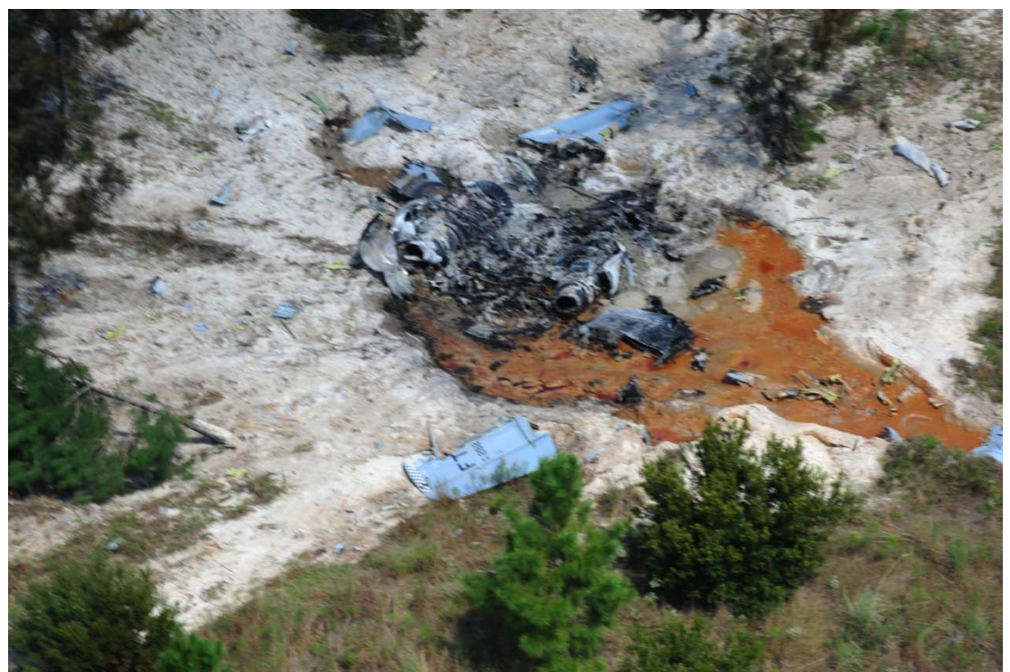
Figure 1. MA at Crash Site

The MA impacted the terrain (See Figure 1) at approximately 1448L about 20 miles northwest of Moody AFB (Tab B-3). The MA was in a clean unarmed configuration for the FCF profile. The impact location was a sandy swamp area, sparsely covered by pine trees (Tab S-5 to S-6).