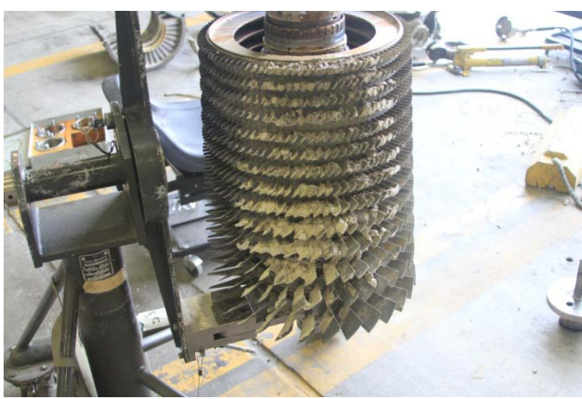
Figure 8. Engine #2 Compressor

Most c ompressor bl ades (See F igure 8) had s tains due t o m ud a nd water, but t he ph ysical evidence shows no significant blade damage (Tab DD-16).