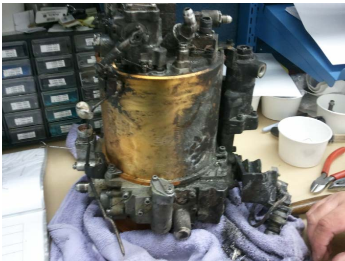
Figure 9. Engine #2 MFC

The starter gear assembly is bent but no torsional shear is noted. The MFC (See Figure 9) was taken to the fuel control overhaul facility at Fleet Reserve Center Southeast at Jacksonville Naval Air S tation for disassembly and analysis. A nalysis of the MFC depicts that there was a core speed of 36-37%, but this data neither conclusively supports nor disproves whether the engine was actually running (Tab DD-5, DD-16 and DD-19).