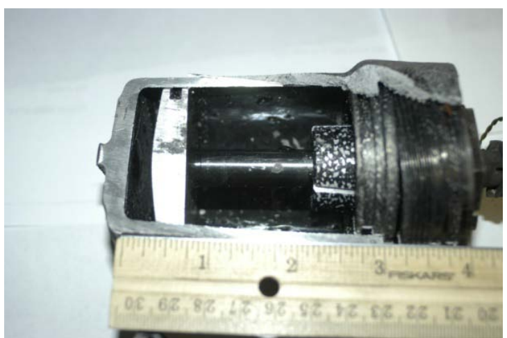
Figure 6. Engine #1 VG Actuator

One VG actuator was found for Engine #1. The TF-34 engineer disassembled the VG actuator (See Figure 6) and determined it to be closed at the time of impact, which implies that the engine core was turning at low or no RPM (Tab DD-12).