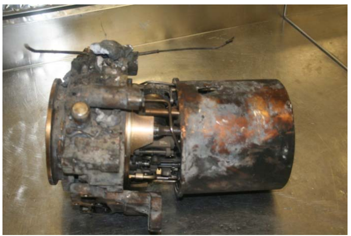
Figure 4. Engine #1 MFC

The accessory gear box fractured in multiple locations with only the Integrated Drive Generator still attached. The starter gear assembly was bent, but no torsional shear was indicated (Tab J-6). The Main Fuel Control (MFC) (See Figure 4) was taken to the fuel control overhaul facility at Fleet R eserve Center Southeast at Jacksonville Naval A ir Station, Florida for disassembly and analysis. A nalysis of the MFC depicts that there was a cor e s peed of 2 0-21%, but this da ta neither conclusively supports nor disproves whether the engine was actually running (Tab DD-5, DD-11 and DD-19).