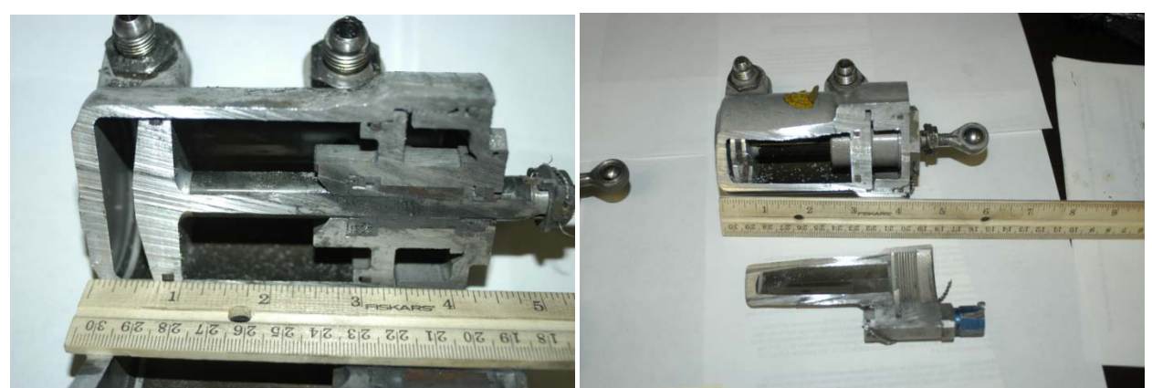
Figure 10. Engine #2: VG Actuator 1 (Left) and VG Actuator 2 (Right)

Both VG actuators were found for Engine #2. T he T F-34 engineer disassembled the VG actuators (See Figure 10) and determined them both to be closed at the time of impact, which implies that the engine core was turning at low or no RPM (Tab DD-17).