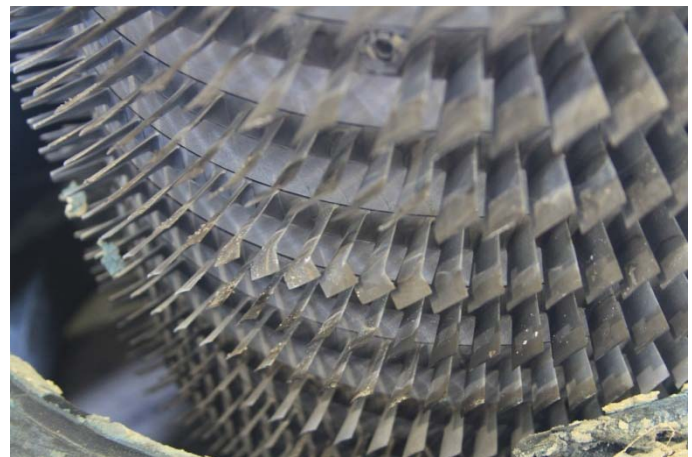
Figure 3. Engine #1 Compressor Blades

Most compressor blades (See Figure 3) had water stains and discoloration, most likely caused by sediments in t he c rash site water. S ome of t he c ompressor blades were da maged, but t he physical evidence reveals the damage occurred on impact and was not causal to the mishap (Tab DD-8 to DD-10).