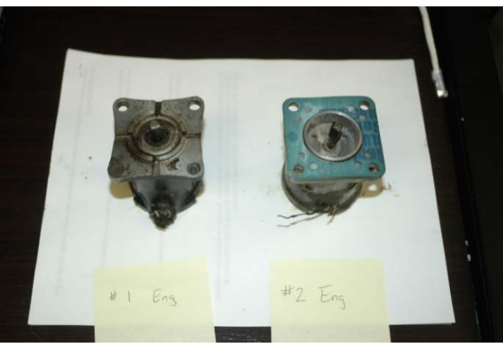
Figure 5. Tachometer Generators

The Tachometer Generator (See Figure 5) had impact damage to its case. However, the shaft was intact and it rotated freely (Tab DD-11).