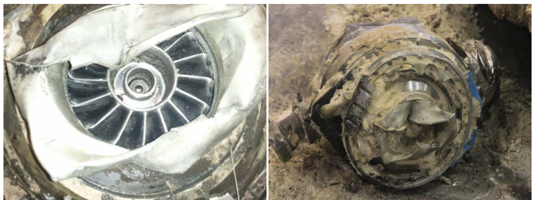
Figure 11. APU Turbine w/dirt removed (Left) and Remains of the APU (Right)

The APU (See Figure 11) was severely damaged by crash forces. The MP testified that the APU gauges indicated it was fully powered when turned on during the mishap flight. (Tab V-1.5 to V-1.6). In addition, an aerospace engineer from the Ogden Air Logistics Center reviewed the MP's testimony, photos of the mishap APU and the technical evaluations of the MA engines conducted during the Safety Investigation Board and the AIB. The aerospace engineer certified that the APU was fully functional at the time of the mishap (Tab DD-3).