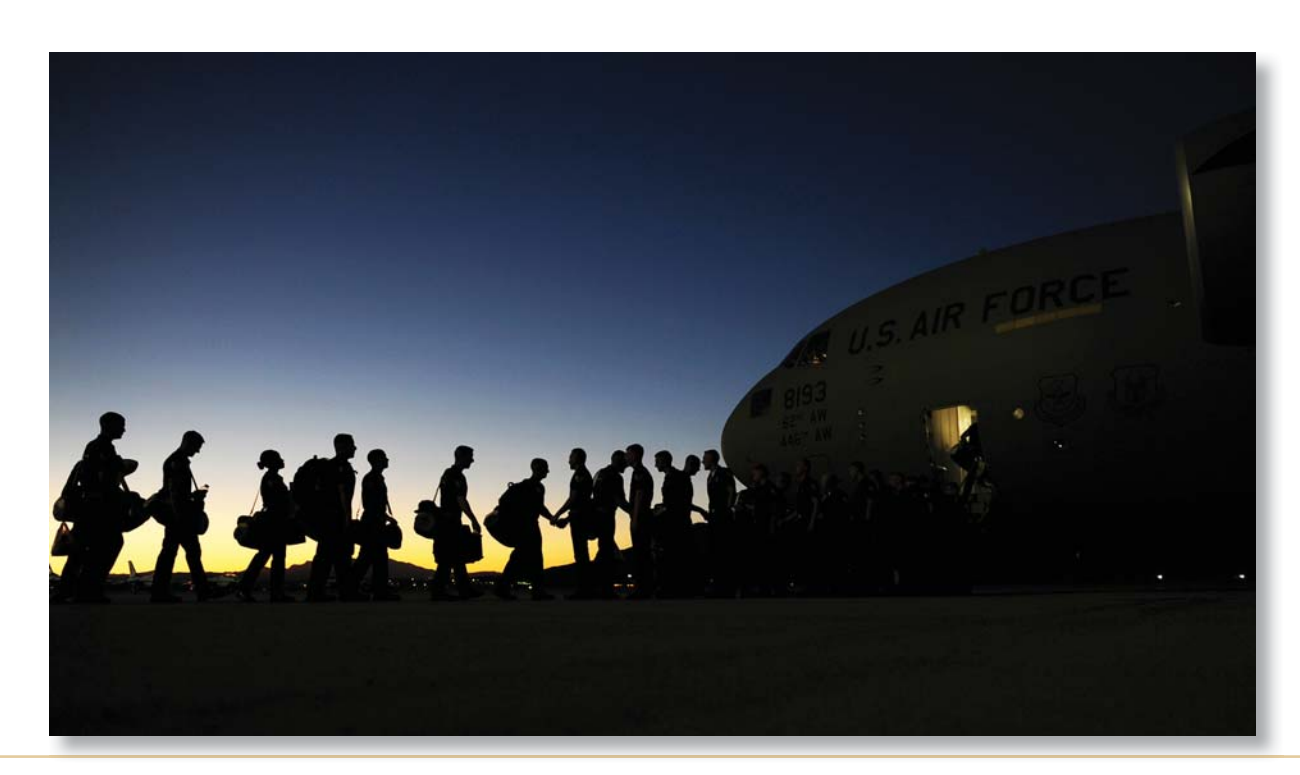
Strengthening Our Relationship of Trust with the Nation