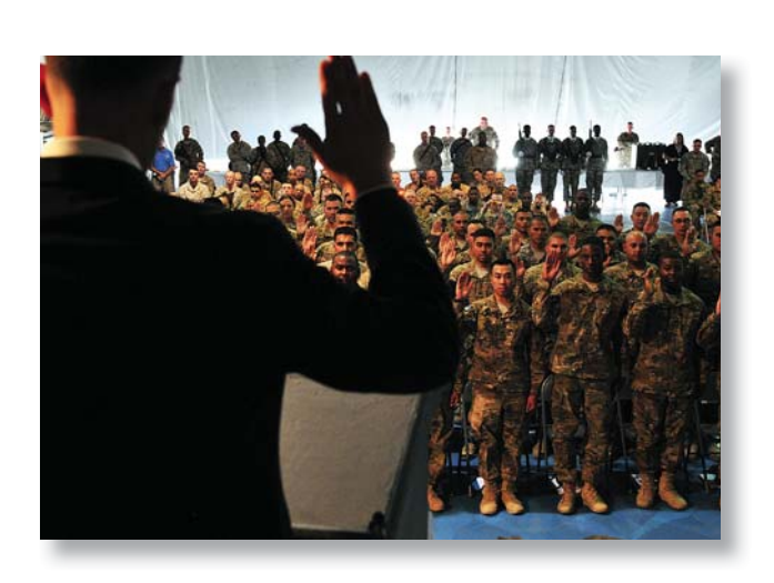
Strengthening Our Relationship of Trust with the Nation

Each Service contributes its own story, rich heritage, and unique