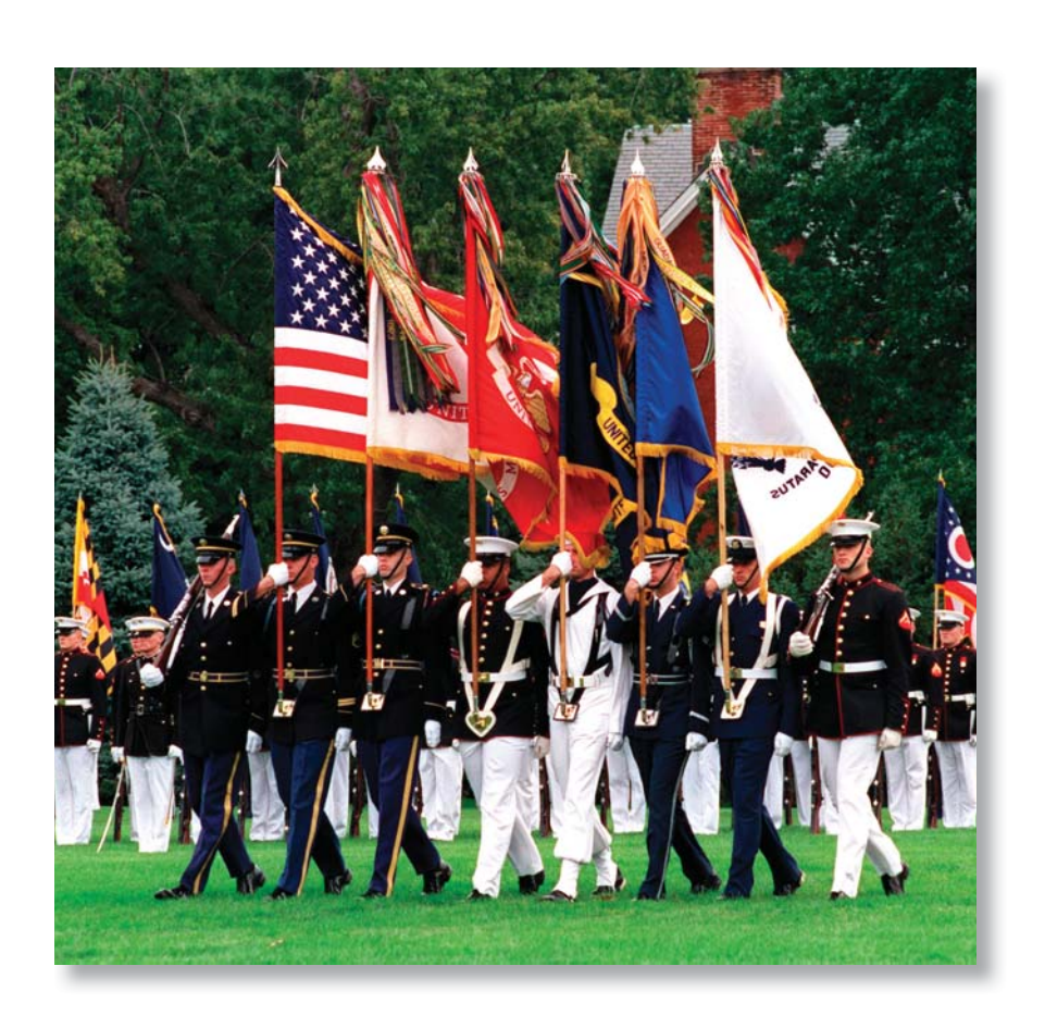
Strengthening Our Relationship of Trust with the Nation

We are and will remain responsible to provide our leaders with options to defend this Nation. The tension between winning the present and winning the future will require hard choices and principled leadership. Transitioning out of a constant combat posture to being ready to fight across all domains will require deep thinking—about the capabilities we need and about who we are. Caring for our families must be a professional legacy just as it as a personal one. The American people have bestowed upon us a sacred trust. Ours is a noble and mighty calling for service and of sacrifice. These past ten years have proven that we are worthy of their trust. The next ten will demand more of the same. I know we will answer the call.