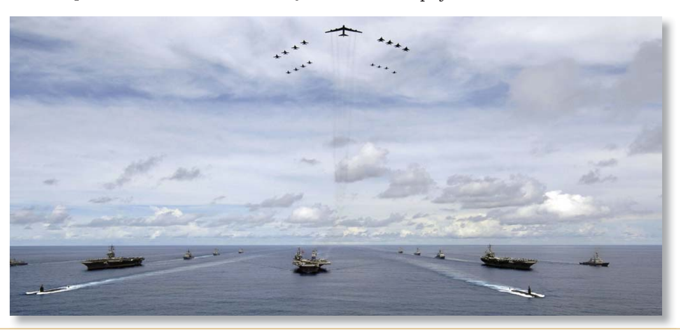
Strengthening Our Relationship of Trust with the Nation

on each other to achieve objectives and create capabilities that do not exist except when combined. It means a regionally-postured, but globally networked and flexible force that can be scaled and scoped to demand. It can close on its objective at a time and place of its choosing and produce irreversible and stable outcomes. Finally, it is a Joint Force that provides a degree of security in balance with what the Nation demands and is willing and able to pay.