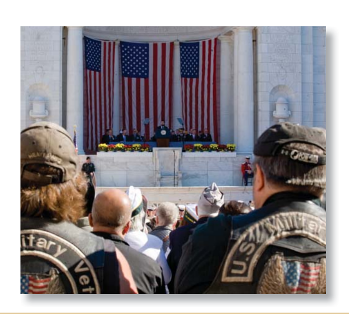
Strengthening Our Relationship of Trust with the Nation

The wars have left deep wounds both seen and unseen. Forever changed by their experience, hundreds of thousands of returning veterans and their family members are confronting significant long-term challenges, and many are facing mental health issues. Rates of substance abuse, domestic violence, suicide, divorce, and homelessness also remain tragically high—a sober reminder that our Nation's security comes with tremendous cost.