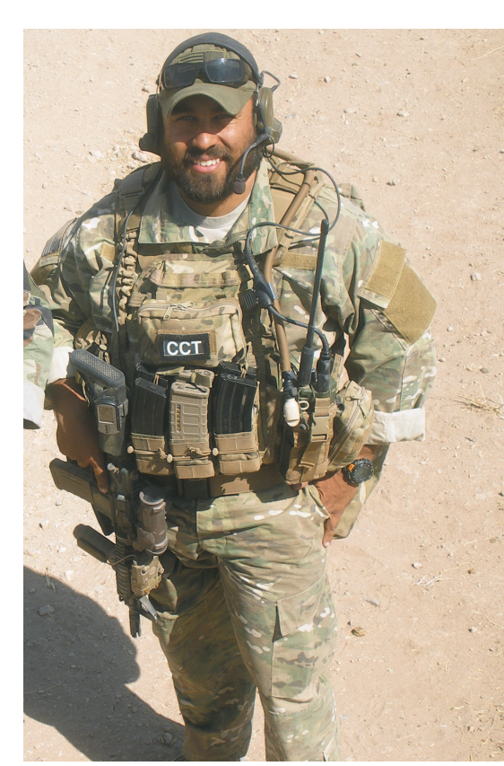
Two years later, Gutierrez considers himself "good to go" and "fully deployable"

"You just go. I don't have time to be a hindrance," he said. "If I'm dead, I'm just dead weight. Everybody has their own