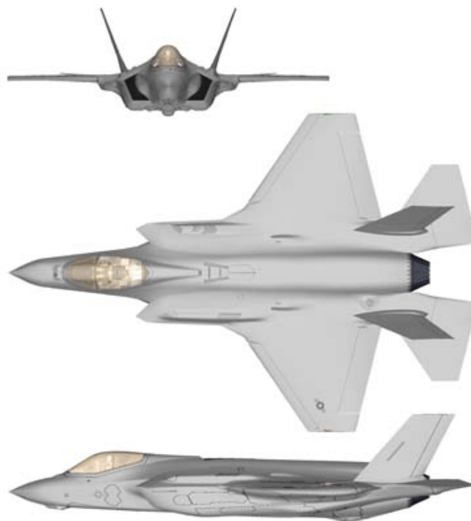
Figure 1. F-35 Lightning II Joint Strike Fighter

leaders have said Air Force STOVL variants would number “in the hundreds.” 5 In December 2004, Air Force leaders confirmed long-running speculation that it would reduce its total purchase of JSFs. Some observers believe it will be by as much as one-third of the 1,763 figure. 6