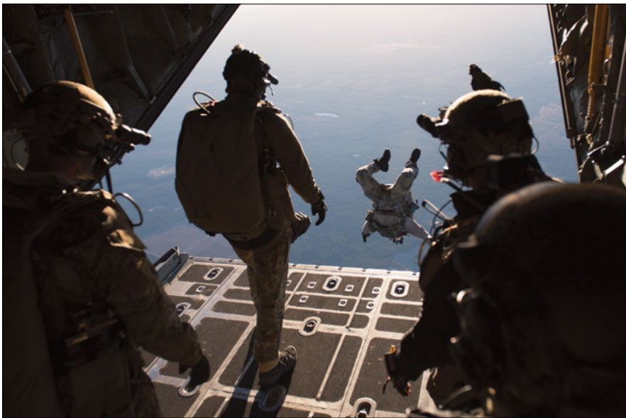
USAF Special Tactics airmen jump from an MC-130H Combat Talon II above Eglin AFB, Fla., in December 2018.