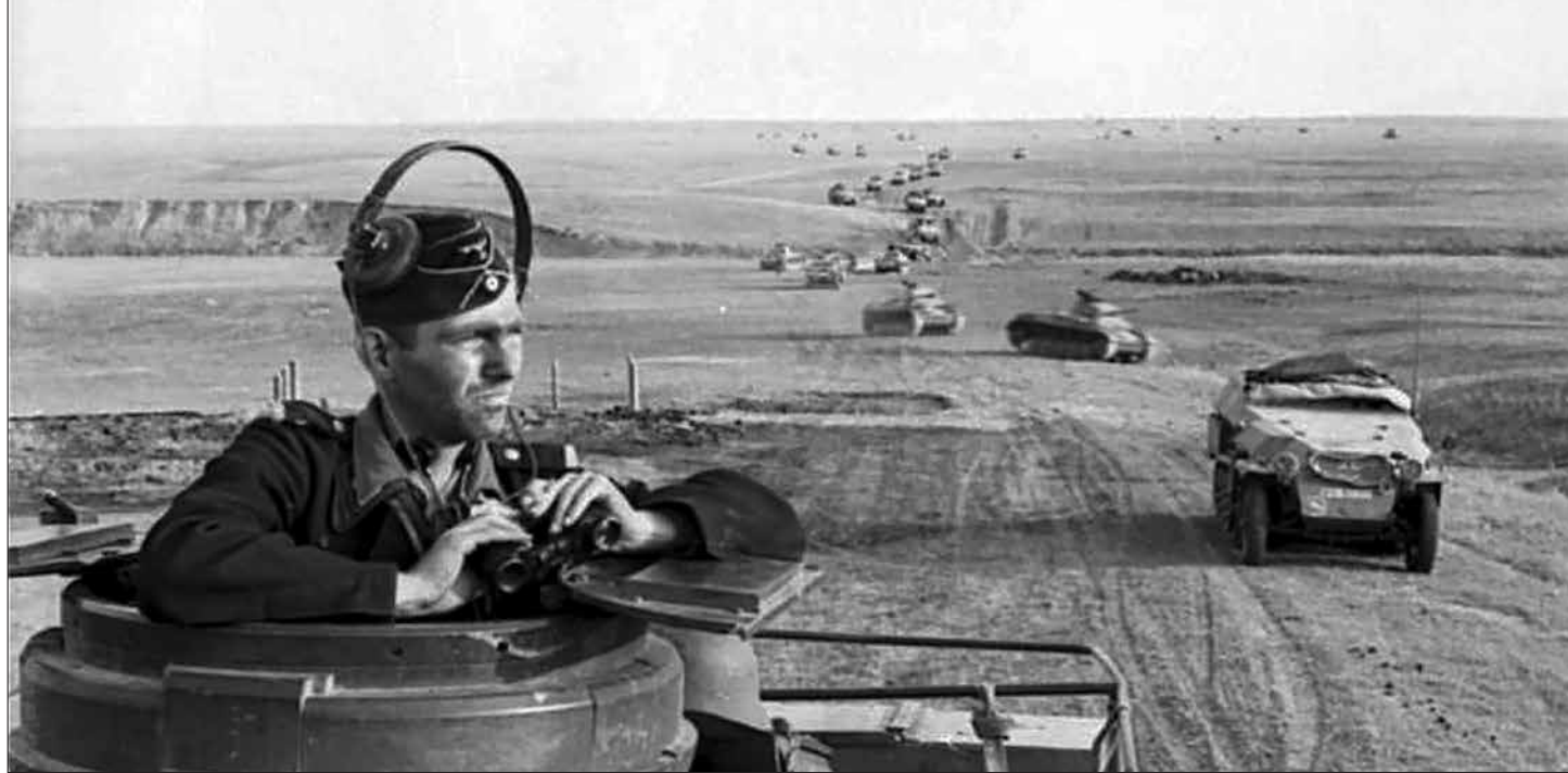
Panzer II armored vehicles race across the steppe from the Don River to Stalingrad.