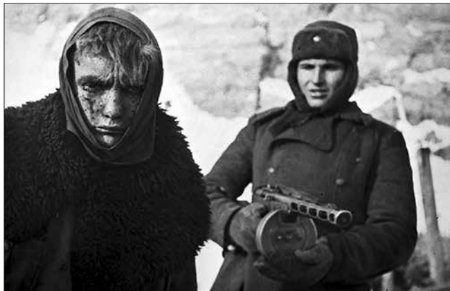
A wounded German prisoner of war, left, is taken at the Battle of Stalingrad.

The Luftwaffe stripped the training program of aircraft and pilots and converted long-range transports and medium bombers, notably He 111s, for transport duty, but the combination could not meet the 500-ton requirement, or even 300.