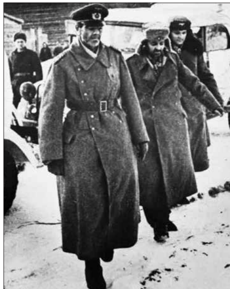
German Lt. Gen. Friedrich von Paulus, left, and aides after their surrender to Soviet forces in Stalingrad.