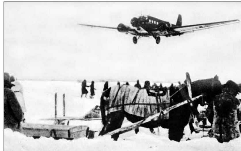
A Ju 52 transport aircraft makes a successful sortie over terrain covered in deep snow. In the battle for Stalingrad, the Germans dropped supplies from the air for their encircled and doomed Sixth Army.

By late July, the Sixth Army was on the upper Don, but advancement was hampered by a shortage of fuel. It was not until Aug. 21 that the Germans pushed forward from their bridgehead on the eastward bulge of the Don. At that point, the rivers reached their closest proximity, separated by about 40 miles.