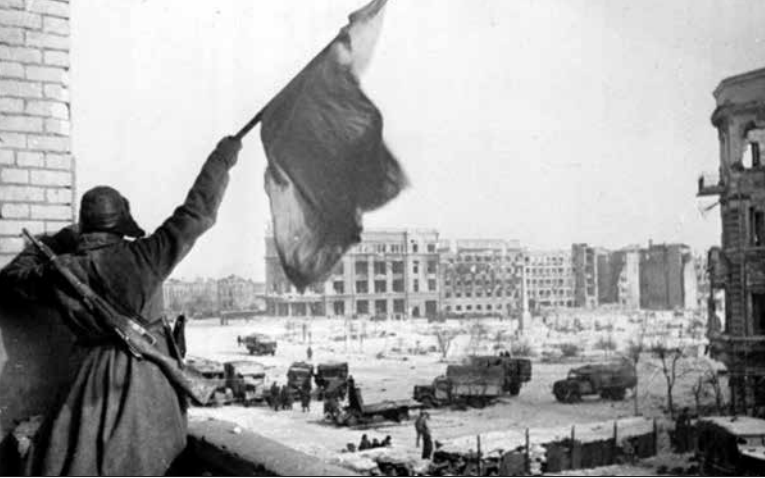
A Soviet soldier waves the Red Banner over the central plaza of Stalingrad in 1943.