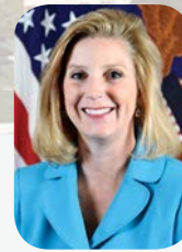
USD, Policy Christine E. Wormuth