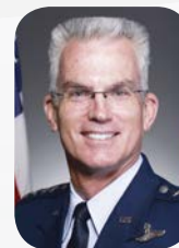
Vice Chairman of the JCS Gen. Paul J. Selva, USAF