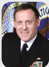
US Cyber Command (Reports to STRATCOM) Adm. Michael S. Rogers