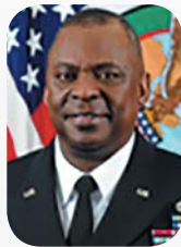
US Central Command Gen. Lloyd J. Austin III, USA