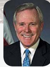
Secretary of the Navy Ray Mabus