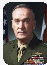
Chairman of the JCS Gen. Joseph F. Dunford Jr., USMC