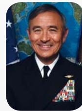
US Pacific Command Adm. Harry B. Harris Jr.