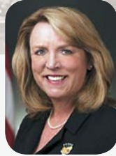
Secretary of the Air Force Deborah Lee James