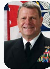
US Northern Command Adm. Bill Gortney