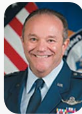
US European Command Gen. Philip M. Breedlove, USAF