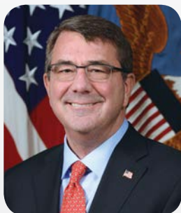
Secretary of Defense Ashton B. Carter