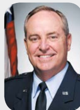
Air Force Chief of Staff Gen. Mark A. Welsh III