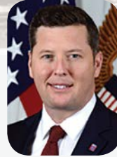
Secretary of the Army Patrick J. Murphy (acting)