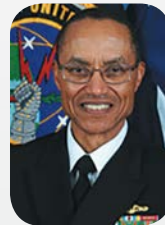
US Strategic Command Adm. Cecil D. Haney