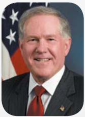
USD, Acquisition, Technology, & Logistics Frank Kendall III