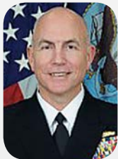
US Southern Command Adm. Kurt W. Tidd