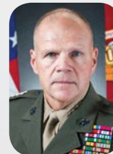
Commandant of the Marine Corps Gen. Robert B. Neller