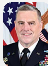
Army Chief of Staff Gen. Mark A. Milley