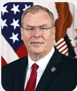
Deputy Secretary of Defense Robert O. Work