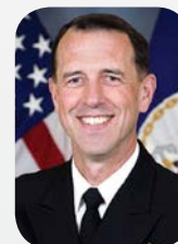
Chief of Naval Operations Adm. John M. Richardson