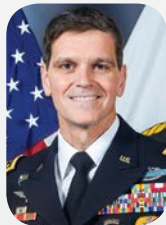
US Special Operations Command Gen. Joseph L. Votel III, USA