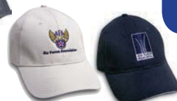
Structured Chino Twill or Brushed Twill Caps $14.65 to $15.25