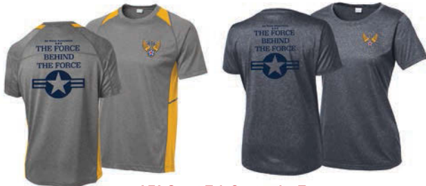
AFA Sport-Tek Contender Tees Men's $25.50 Ladies' $24.00