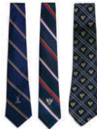
Ties and Scarves