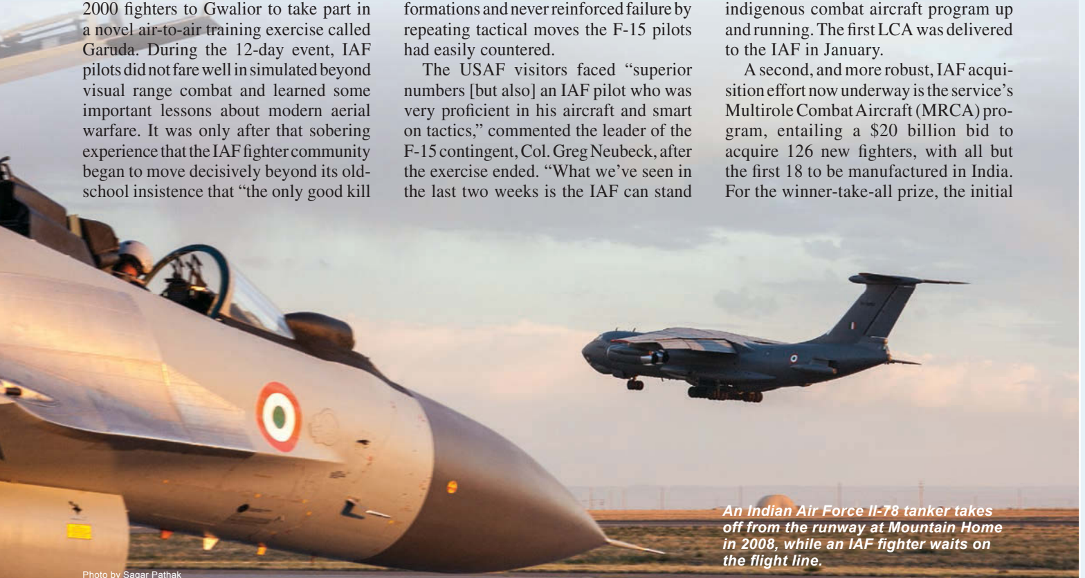
An Indian Air Force II-78 tanker takes off from the runway at Mountain Home in 2008, while an IAF fighter waits on the flight line.

A second, and more robust, IAF acquisition effort now underway is the service's Multirole Combat Aircraft (MRCA) program, entailing a $20 billion bid to acquire 126 new fighters, with all but the first 18 to be manufactured in India. For the winner-take-all prize, the initial