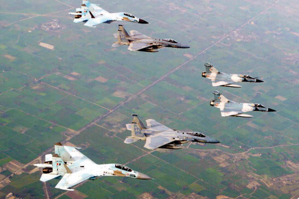
Two IAF Mirage 2000s lead a formation of USAF F-15s and IAF Su-30Ks over India during Cope India '04. Plans for future Cope India and Red Flag exercises are in the works.

remains unclear when the MRCA effort will finally succeed in putting rubber on the ramp at IAF bases.