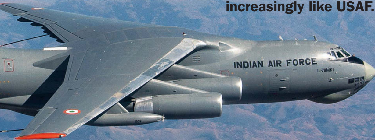
An Indian Air Force IL-78 refuels an IAF Su-30MKI Flanker while flying in formation with two USAF F-15s during preparations at Mountain Home AFB, Idaho, for a Red Flag mission in 2008.

Over time, the IAF has become increasingly like USAF.