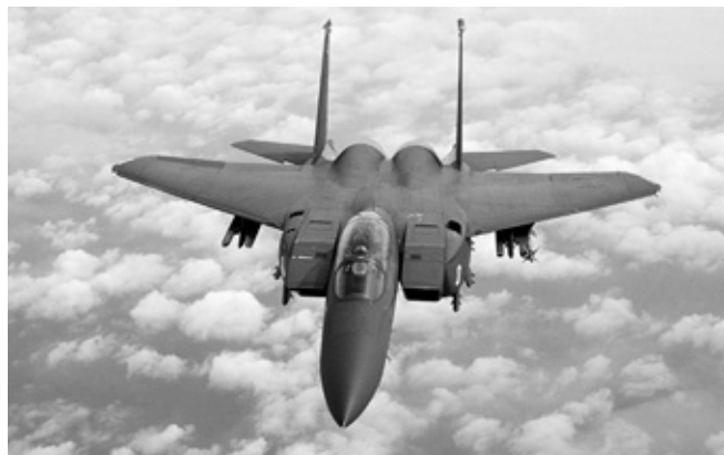
An F-15E Strike Eagle from the 333rd Fighter Squadron, Seymour Johnson AFB, N.C., flies on Aug. 25, 2000.

Has never been shot down in air-to-air combat ★ was first US fighter with thrust sufficient to accelerate vertically ★ destroyed satellite with ASM-135 missile ★ set eight time-to-climb records in 1975 ★ reached 98,425 ft altitude in 3 min, 28 sec ★ downed 41 Syrian fighters (zero losses) in 1982 Lebanon War ★ destroyed 18 Iraqi jets on ground at Tallil in Gulf War ★ downed Iraqi Mi-24 helo in flight with a 2,000-lb bomb ★ flew longest-ever fighter mission (15.5 hours, Afghanistan) ★ escorted Israeli strike against Iraq's Osirak nuclear plant in 1981.