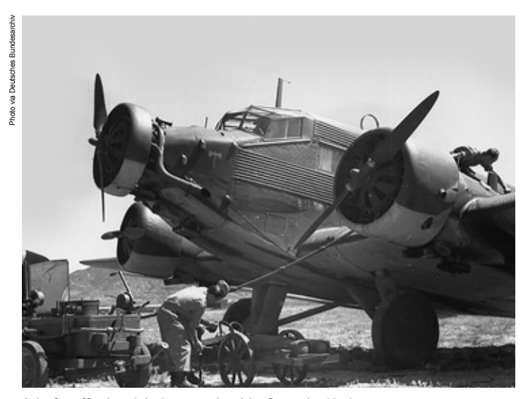
A Luftwaffe Ju 52 being serviced in Crete in 1943.