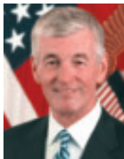
Secretary of the Army John M. McHugh