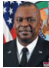
US Central Command Gen. Lloyd J. Austin III, USA