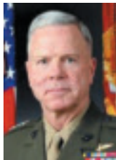
Commandant of the Marine Corps Gen. James F. Amos