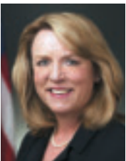
Secretary of the Air Force Deborah Lee James