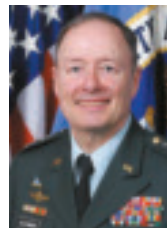
US Cyber Command (Reports to STRATCOM) Gen. Keith B. Alexander, USA