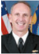
Chief of Naval Operations Adm. Jonathan W. Greenert