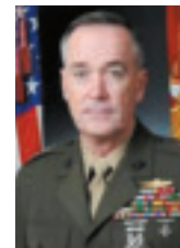
US Forces-Afghanistan (Reports to CENTCOM) Gen. Joseph F. Dunford Jr., USMC