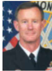
US Special Operations Command Adm. William H. McRaven