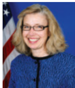
Deputy Secretary of Defense Christine H. Fox (acting)