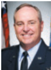
Air Force Chief of Staff Gen. Mark A. Welsh III