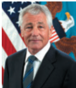
Secretary of Defense Chuck Hagel