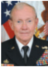
Chairman Gen. Martin E. Dempsey, USA