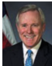
Secretary of the Navy Ray Mabus