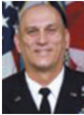
Army Chief of Staff Gen. Raymond T. Odierno