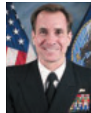
ASD, Public Affairs Rear Adm. John Kirby