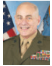
US Southern Command Gen. John F. Kelly, USMC