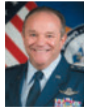
US European Command Gen. Philip M. Breedlove, USAF