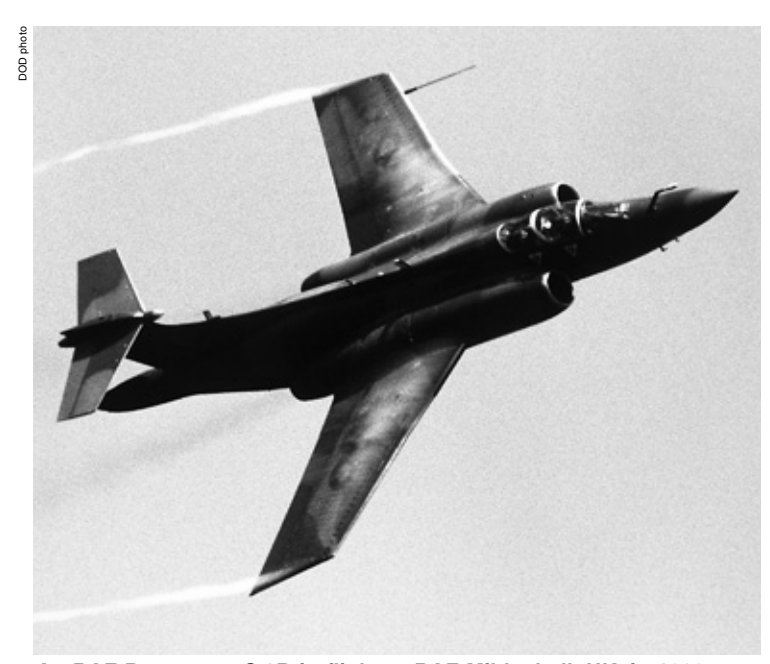
An RAF Buccaneer S.2B in flight at RAF Mildenhall, UK, in 1988.