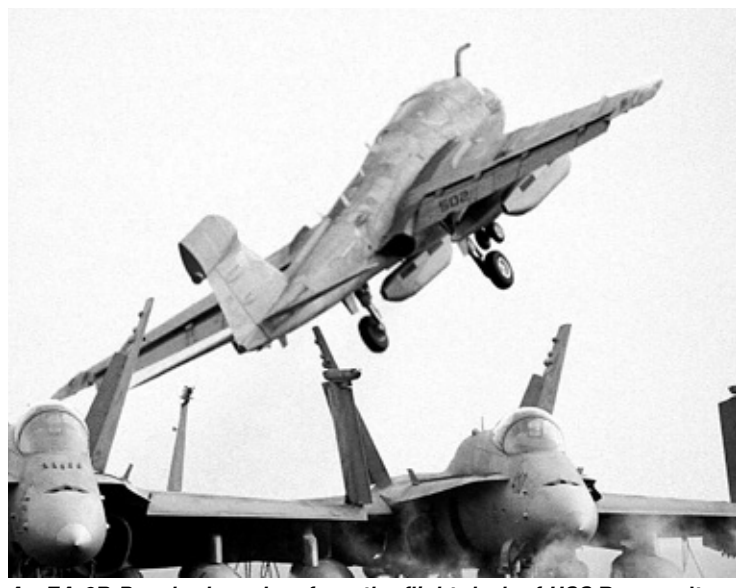
An EA-6B Prowler launches from the flight deck of USS Roosevelt.

Preceded by interim EA-6A "Electric Intruder," built in small numbers for USMC ★ features canopy embedded with gold, which blocks electromagnetic interference ★ suffered 55 losses in combat or training accidents ★ posted accident rate three times that of any other Navy or USMC aircraft in the 1980s ★ flies under stringent high-angle-of-attack restrictions ★ can sense location of buried improvised explosive devices and jam their detonation signals.