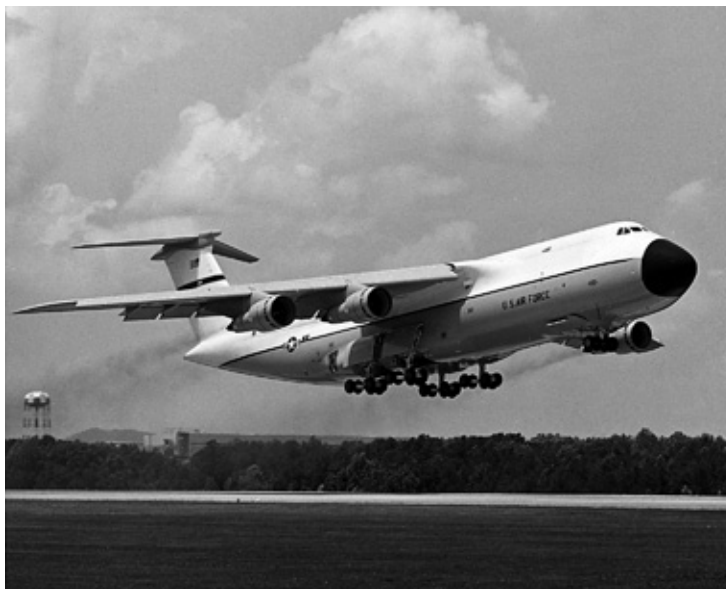
The C-5 has seen service in every major contingency since 1969.