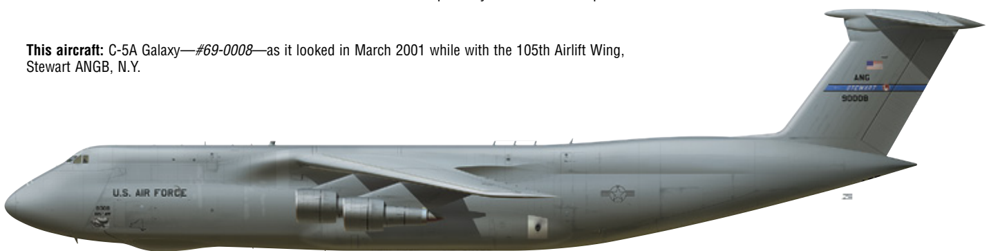
This aircraft: C-5A Galaxy—#69-0008—as it looked in March 2001 while with the 105th Airlift Wing, Stewart ANGB, N.Y.