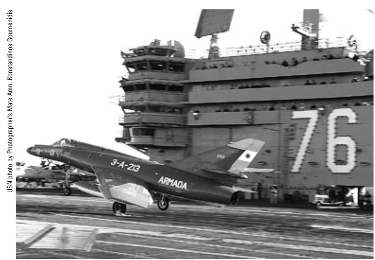
An Argentine Navy Super Étendard performs a touch-and-go from the aircraft carrier USS Ronald Reagan.