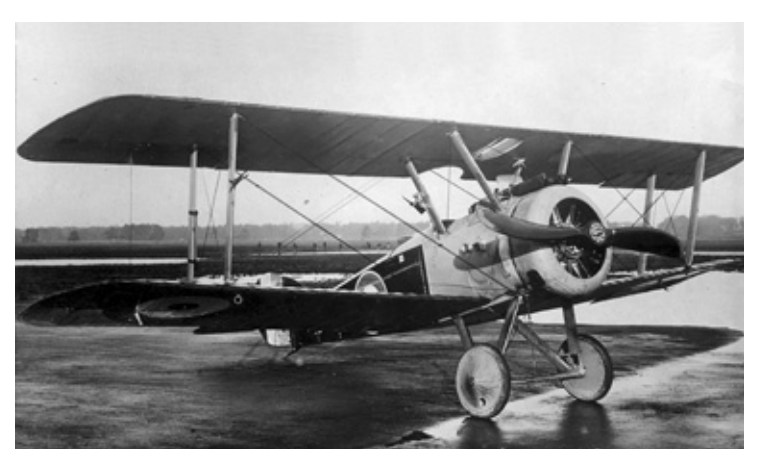
Sopwith Camel of the Royal Air Force.

Designed by Sopwith Aviation ★ built by Sopwith and others ★ first flight Dec. 22, 1916 ★ crew of one or two (trainer) ★ number built 5,490 ★ one Clerget 9B rotary engine (standard power plant) ★ armament two Vickers .303-caliber machine guns, up to four 20-lb Cooper bombs ★ Specific to F.1: max speed 113 mph ★ cruise speed 90 mph ★ max range 250 mi ★ weight (loaded) 1,500 lb ★ span 26 ft 11 in ★ length 18 ft 9 in ★ height 8 ft 6 in.