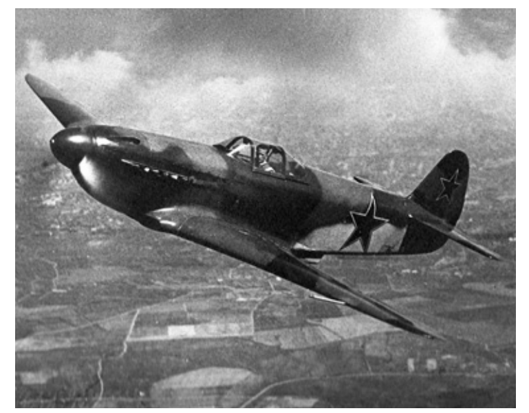
Yak-3 was one of the most maneuverable fighters of World War II.

Nicknamed "Ubiytsa"—"Killer,"—and "Ostronosyi"—"Sharp Nose" ★ caused German pilots to avoid combat below 16,000 feet ★ climbed at 498 mph when fitted with rocket engine (Yak-3RD) ★ flown by postwar air forces of Poland, Yugoslavia ★ built in 12 variants ★ recreated (replicas) by Yakovlev since 1991 ★ had smaller wing area than even superlight Japanese A6M Zero ★ lost rear plywood surfaces in high-speed dives.