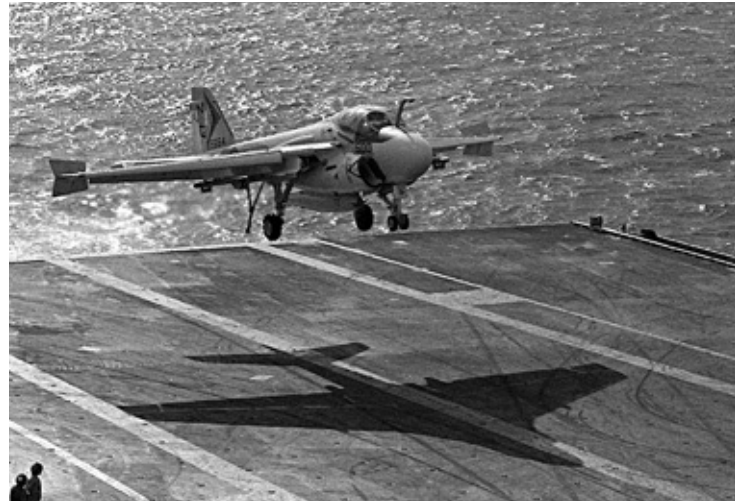
An Intruder comes in for a landing on the deck of USS Constellation.