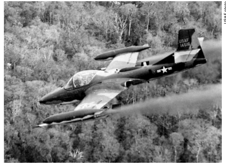
An A-37A firing rockets in Vietnam.

Nicknamed "Super Tweet" \star survived collisions with trees and still returned to base \star flown by Air National Guard until 1990s \star remains in service in South America \star used by both Ecuador and Peru in 1995 border war \star served with South Korea's aerobatic team \star used by total of 14 air forces \star captured aircraft flown by North Vietnam Air Force in war with China \star could conserve fuel by flying on only one engine.