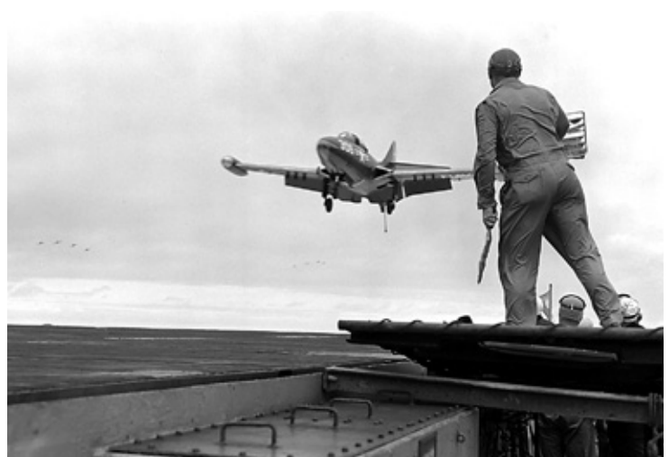
A landing signal officer on board USS Boxer (CVA-21) brings in an F9F from a combat mission over North Korea.

Flew 78,000 sorties in Korean War ★ scored first air-to-air Navy kill (North Korean Yak 9 on July 3, 1950) ★ downed five Soviet MiG-15s off Vladivostok (not officially credited) ★ appeared prominently in films "Men of the Fighting Lady" (1954) and "The Bridges at Toko-Ri" (1954) ★ became first Navy aircraft to use ejection seat in combat ★ was first jet aircraft used by Blue Angels (1949-1955) ★ flown by Argentine Air Force against rebel forces in the 1960s.