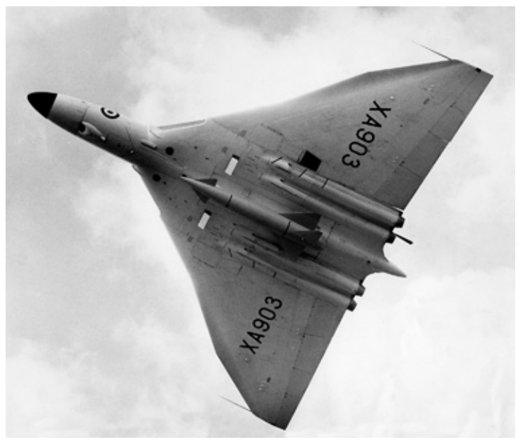
For its time, the delta wing was cutting edge.

Appeared in 1965 James Bond thriller "Thunderball" \star nicknamed "Tin Triangle" \star carried nuclear bombs named Yellow Sun, Violet Club, Blue Danube, Red Beard \star performed near-vertical bank, upward barrel roll at 1955 Farnborough air show \star flew Britain-Australia route in record 20 hours, three minutes (1961) \star modified for maritime radar reconnaissance and air tanking \star began as a radically new tailless design \star had only two ejection seats (for pilots) \star crashed into Detroit suburb in 1958.