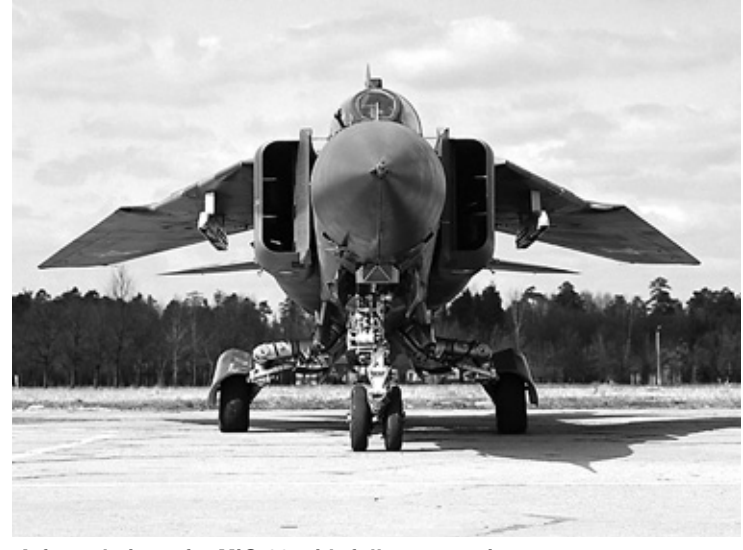
A frontal view of a MiG-23 with fully swept wings.

Designed, built by Mikoyan-Gurevich in the USSR ★ first flight April 10, 1967 ★ crew of one (two in trainer) ★ number built some 5,000 ★ Specific to MiG-23MF: one Tumansky R-29 turbojet engine ★ armament one 23 mm cannon, variety of missiles such as R-3R, R-3S, AA-7, AA-8, AA-11 ★ load several 1,100-lb bombs ★ max speed 1,550 mph ★ cruise speed 550 mph ★ max range 1,600 mi ★ weight (loaded) 44,315 lb ★ span 46 ft 9 in (forward), 26 ft 9 in (swept) ★ length 55 ft 2 in ★ height