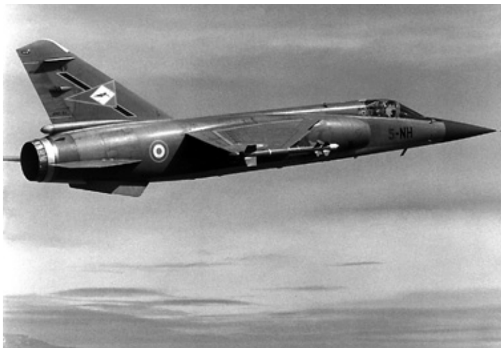
France found many buyers for the Mirage.