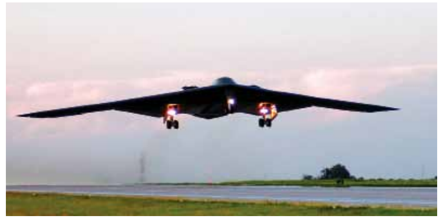
B-2A Spirit

flight-control system, actuating moving surfaces at the wing trailing edges that combine aileron, elevator, and rudder functions. A landing gear track of 40 ft enables the B-2 to use any runway that can handle a Boeing 727 airliner.