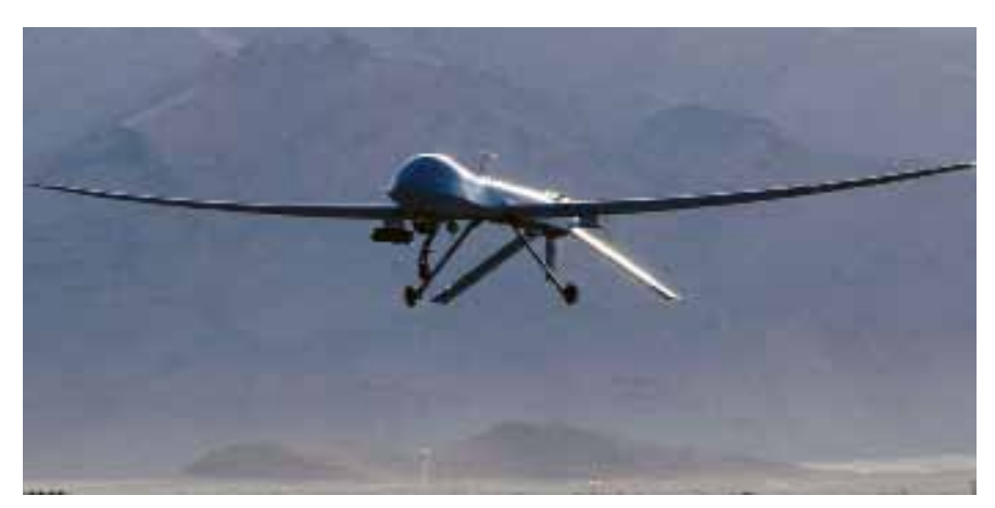
MQ-1 Predator

EC-130E ABCCC Airborne Battlefield Command and Control Center. Seven aircraft were updated by Unisys to ABCCC III standard. The advanced JTIDS received data transmitted by AWACS aircraft and other systems, enabling the crew to see a real-time picture of air operations over a combat area. Now retired