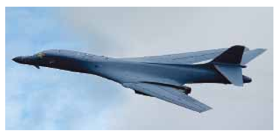
B-1B Lancer (Clive Bennett)

The B-1's onboard self-protection electronic jamming equipment, radar warning receiver (ALQ-161), expendable countermeasures (chaff and flare) system, and ALE-50