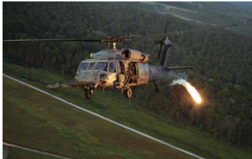
HH-60G Pave Hawk

Based on the Boeing 747-200B airframe, two VC-25As assigned to JB Andrews, Md., support the President. Aircraft are equipped with staff work areas, a conference room, a general seating area, and an executive office. Communications capability includes worldwide secure and clear communications equipment. Upgrades include