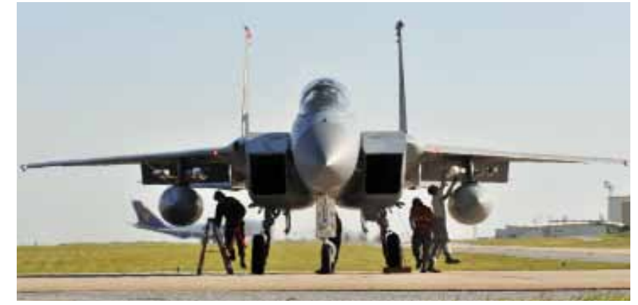
F-15C Eagle

Armament: one internally mounted M61A1 20 mm