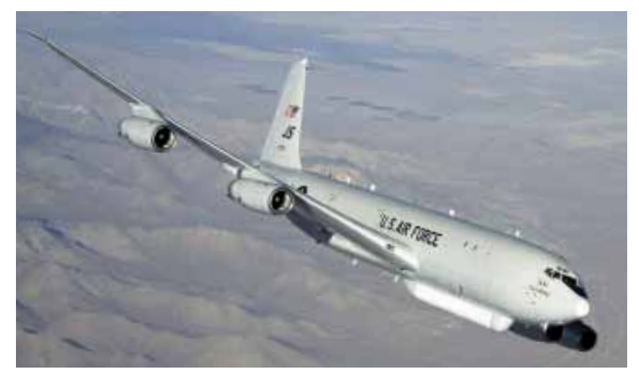
E-8C Joint STARS

Joint STARS (Surveillance Target Attack Radar System)