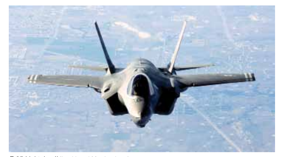
F-35 Lightning II

Accommodation: pilot only, on zero/zero ejection seat.