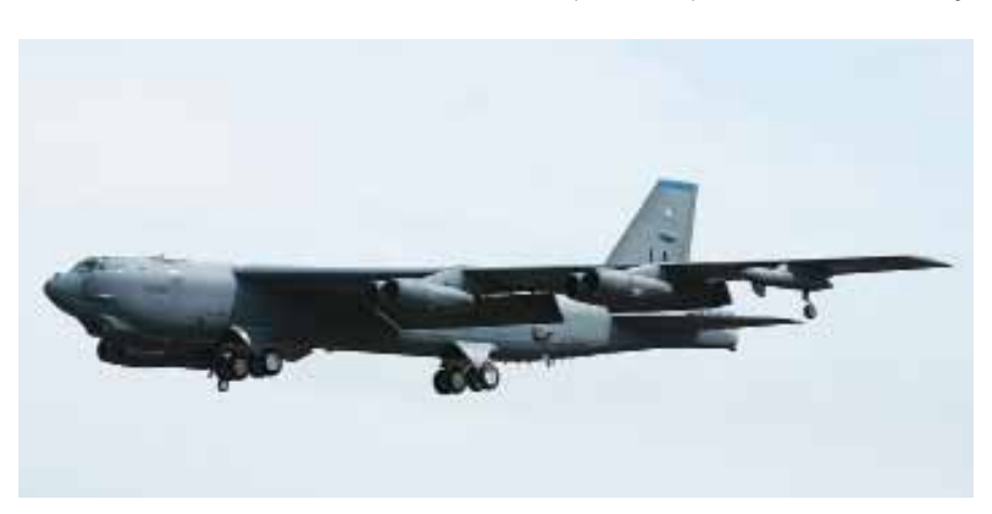
B-52H Stratofortress (Clive Bennett)

B-52H. The only version still in service, the H introduced TF33 turbofans, providing increased unrefueled range, and improved defensive armament. First flown July 1960, 102 were built, with deliveries between May 1961 and October 1962. The B-52 currently is employable for both conventional and nuclear missions. As the Air Force's only nuclear or conventional cruise missile carrier, it performs multiple cruise missile launches at high