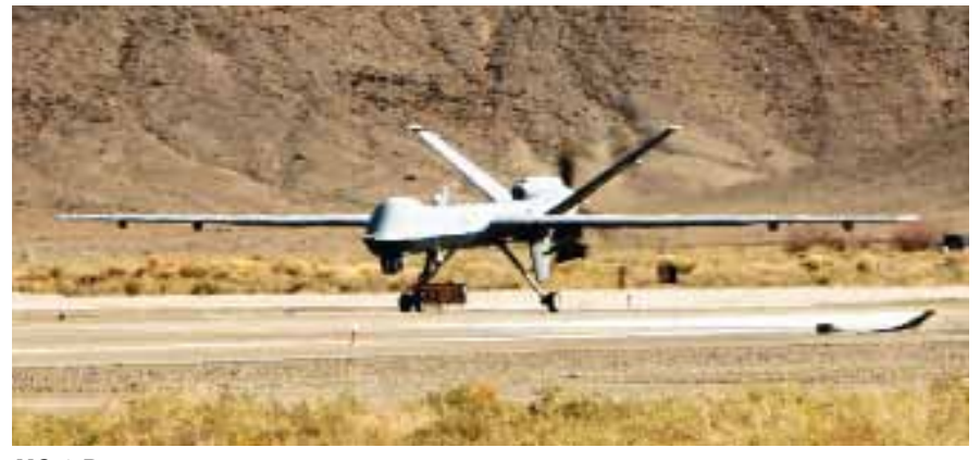
MQ-9 Reaper (Lawrence Crespo)

Brief: A high-altitude, long-range, long-endurance UAV. Function: Unmanned surveillance and reconnaissance aircraft