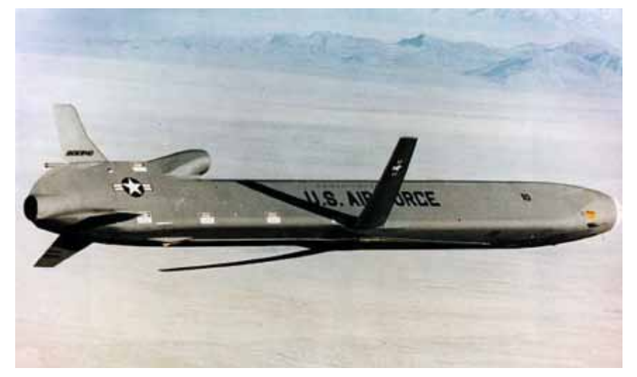
AGM-86 Air Launched Cruise Missile

Weight: gross (A) 1,543 lb, (B) 1,157 lb. Performance: max permitted speed 155 mph, aspect ratio (A) 24:4, (B) 22:2.