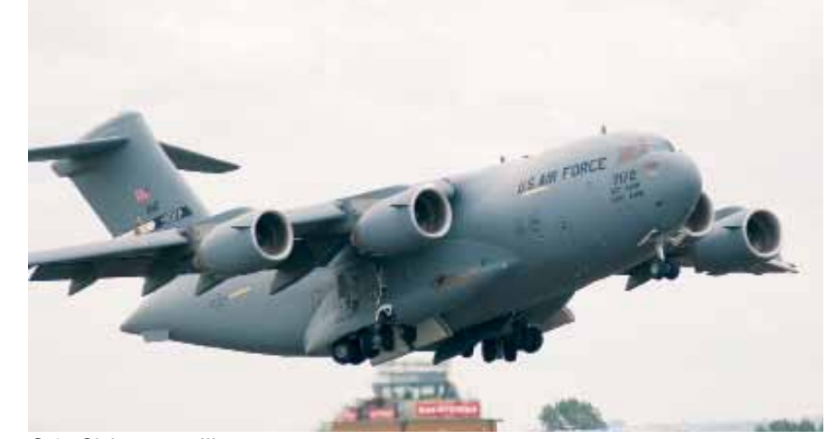
C-17 Globemaster III (Clive Bennett)

Performance: normal cruising speed 484 mph at 35,000 ft or 518 mph (Mach .77) at 28,000 ft, unrefueled range with 160,000-lb payload 2,760 miles, additional 690 miles with extended-range fuel containment system (ERFCS), unlimited with refueling.