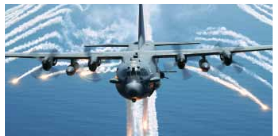
AC-130H Gunship (SrA. Julianne Showalter)

The system development and demonstration (SDD) phase, begun in October 2001, focuses on system development, test and evaluation, logistics support, and LRIP planning. A total of 18 test aircraft are being built, 12 for flight testing, six for nonairborne activities. Lockheed Martin completed assembly of the first F-35A flight-test