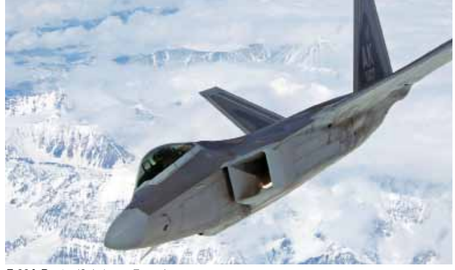
F-22A Raptor (SrA. Laura Turner)

F-16C (single-seat) and F-16D (two-seat) aircraft were introduced at production Block 25 with MSIP II improve-