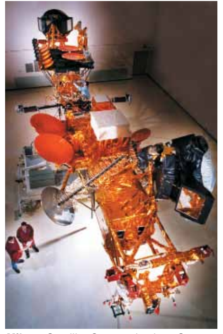
Milstar Satellite Communications System

life, faster processors, and a new civil signal on a third frequency. The first GPS Block IIF launch is scheduled for 2010. Future generation GPS III satellites will provide improved accuracy, availability, integrity, and resistance to jamming. Launch is slated for 2014