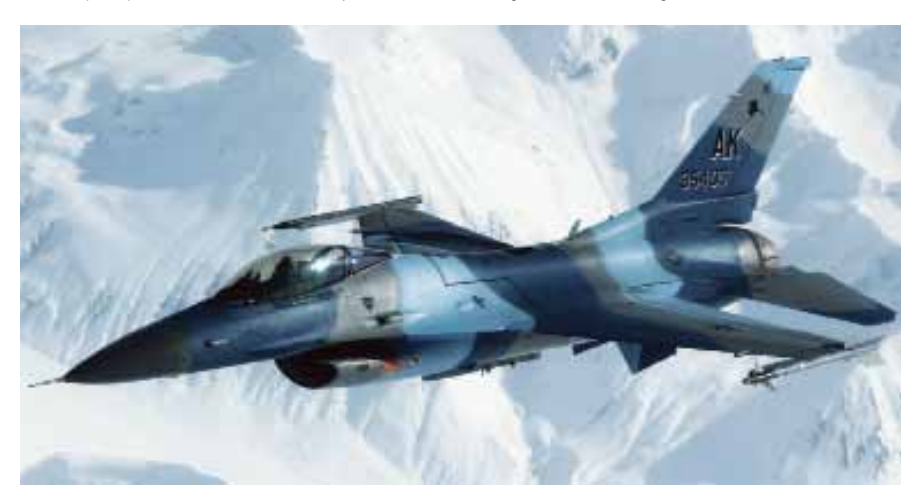
F-16 Fighting Falcon (SrA. Jonathan Snyder)

F-16CG Block 40/42 aircraft specialize in night attack operations with precision guided weapons. Follow-on improvements include ALE-47 improved defensive countermeasures, ALR-56M advanced Very High Speed Integrated Circuit (VHSIC) technology in the APG-68(V5) fire-control radar, a ring-laser gyro INS, GPS, core avion-ics hardware, enhanced-envelope gunsight, digital flight controls, automatic terrain following, increased takeoff weight and maneuvering limits, an 8,000-hour airframe,