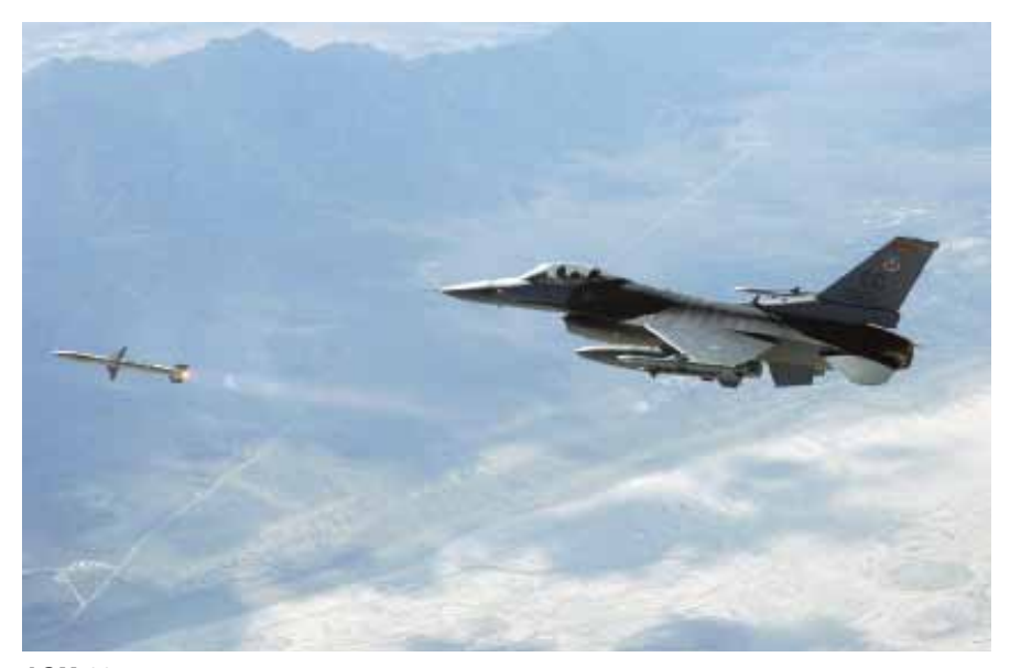
AGM-88 High-speed Anti-Radiation Missile

Brief: A supersonic, short-range, IR-guided air-to-air missile carried by fighter aircraft, having a high-explosive warhead.