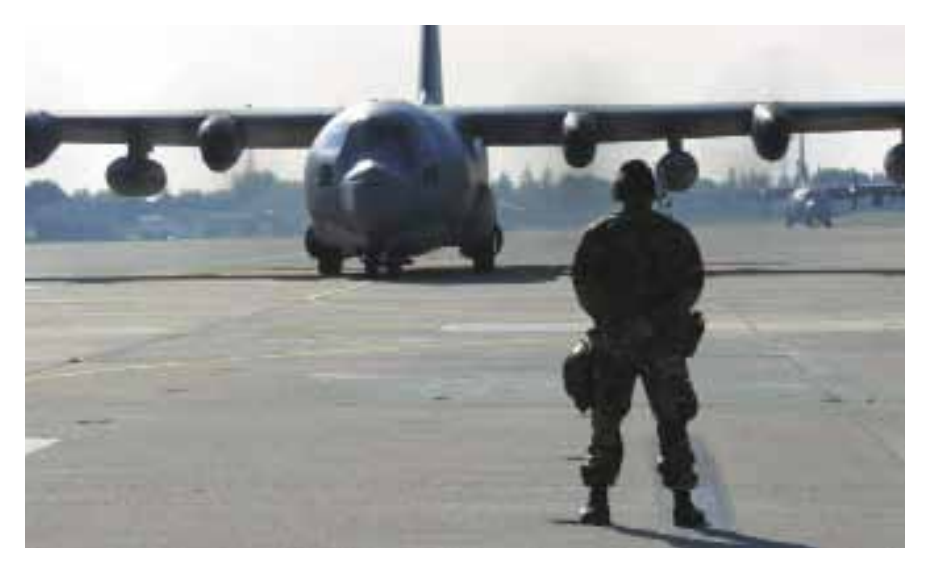
MC-130P Combat Shadow

MC-130P Combat Shadow aircraft fly clandestine formation or single-ship intrusion of hostile territory missions to