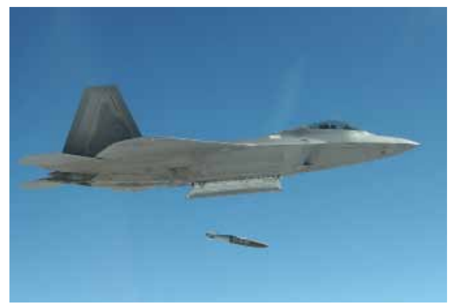
GBU-32 Joint Direct Attack Munition

SDB I is capable of destroying high-priority fixed and stationary targets from both fighters and bombers in internal bays or on external hardpoints. SDBs can be targeted and released against single or multiple targets. Target coordinates are loaded in the weapon prior to release either on the ground or in the air by aircrew. Once the weapon is released, it relies on GPS/INS augmented by Differential GPS to self-navigate to the impact point. SDB increases loadout, decreases collateral damage, and improves aircraft sortie generation times. GBU-39