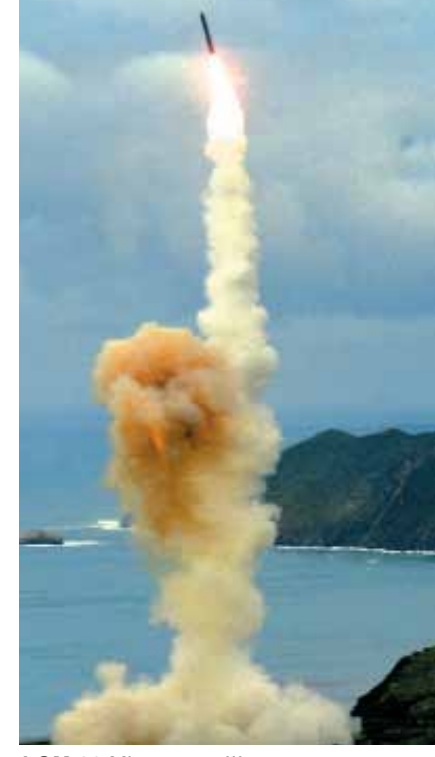
LGM-30 Minuteman III

A key element in the US strategic deterrent posture, Minuteman is a three-stage, solid-propellant ICBM, housed in an underground silo.