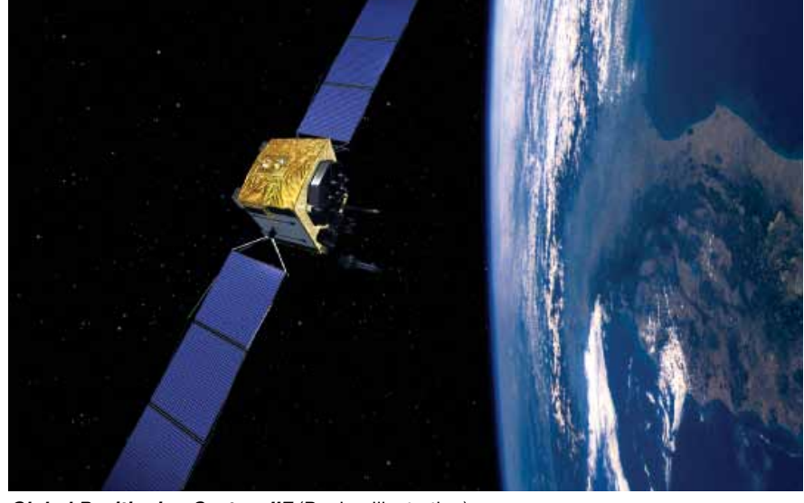
Global Positioning System IIF (Boeing illustration)

Constellation: five (III); 14 deployed/eight currently operational