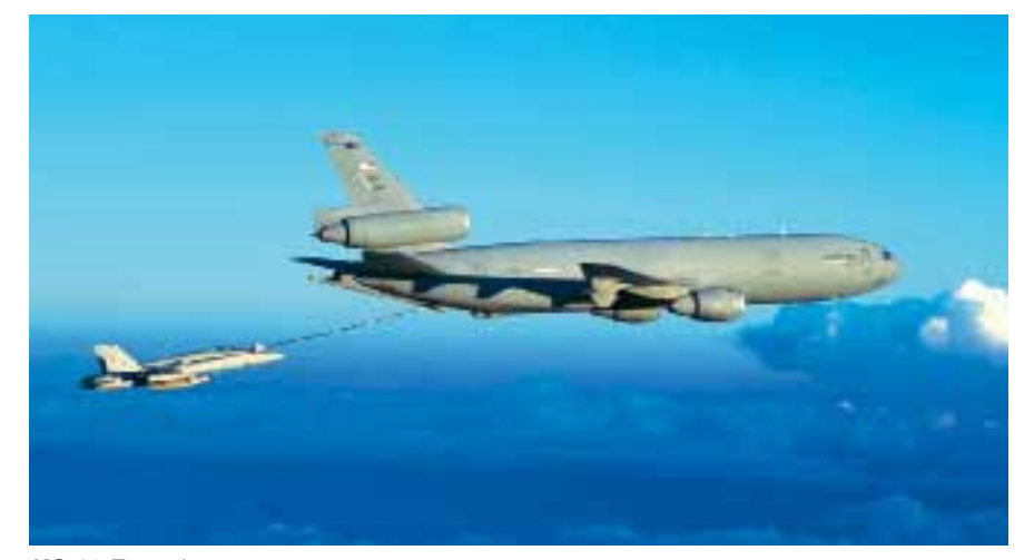
KC-10 Extender

Contractor: Boeing. Power Plant: (KC-135R/T) four CFM International F108-CF-100 turbofans, each 22,224 lb thrust; (KC-135E) four Pratt & Whitney TF33-PW-102 turbofans,