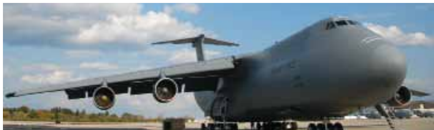
A C-5A on the ramp at Stewart ANGB, N.Y.

Youngstown ARS, Ohio 44473-5912; 14 mi. N of Youngstown. Phone: 330-609-1000; DSN 346-1000. Units: 910th Airlift Wing (AFRC); Army Corps of Engineers; Army, Navy, and Marine Corps Reserve units; FAA. History: activated 1953. Area: 230 acres. Runways: three, primary length 9,000 ft. Altitude: 1,196 ft. Full-time personnel: AFRC, 282; ANG, 17. Lodging: 142 beds. Limited exchange.