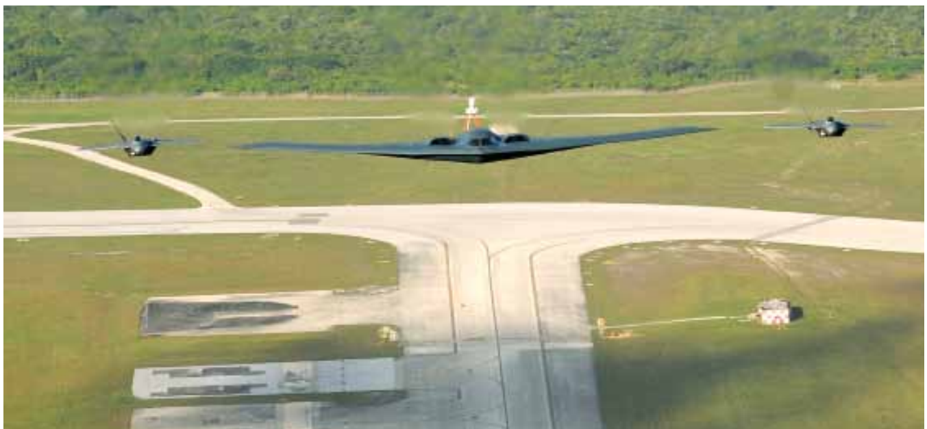
F-22 Raptors and a B-2 bomber in formation over Andersen AFB, Guam.