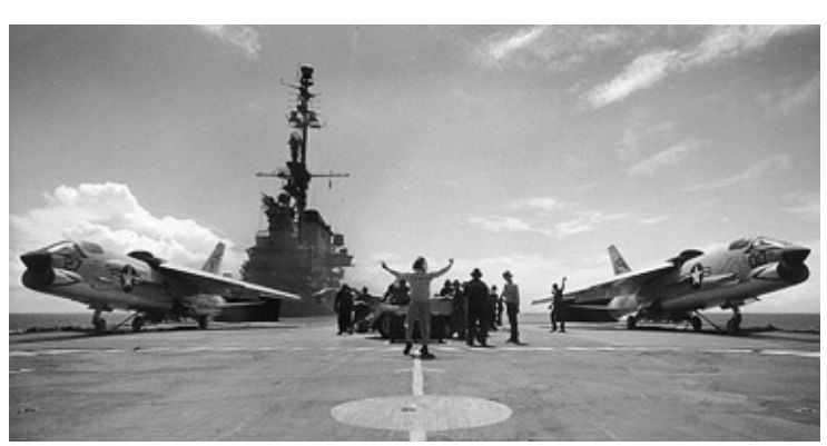
Crusaders on deck, with wings raised seven degrees.