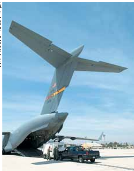
Reservists load an equipment trailer onto a C-17 Globemaster III at March ARB, Calif.