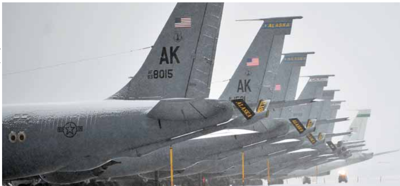
KC-135 tankers from Alaska and Grand Forks AFB, N.D., line up at Eielson AFB, Alaska, during a winter storm.