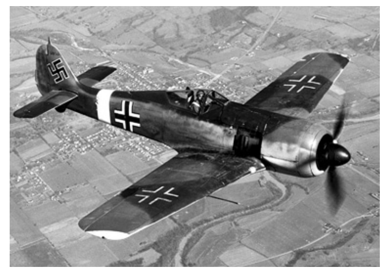
This captured Fw 190G-3 was photographed during a USAAF flight test.