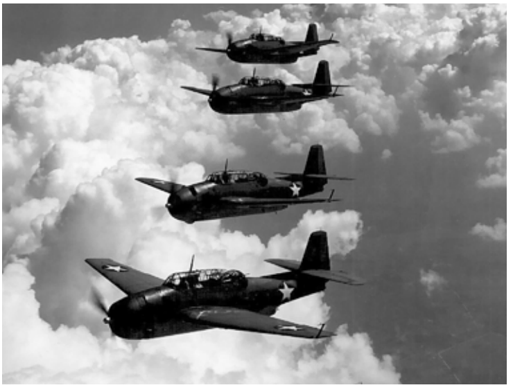
Quartet of Avengers over the Pacific.

Unveiled in public on Dec. 7, 1941, Pearl Harbor Day ★ built in 12 models, more than 30 variants ★ nicknamed Chuff, Pregnant Beast, Turkey, and (in Royal Navy) Tarpon ★ flown in World War II by US Navy, US Marine Corps, Royal Navy, Royal New Zealand Air Force ★ featured in 1944 Hollywood film, "Wing and a Prayer" and as Flight 19 in the 1977 film "Close Encounters of the Third Kind."