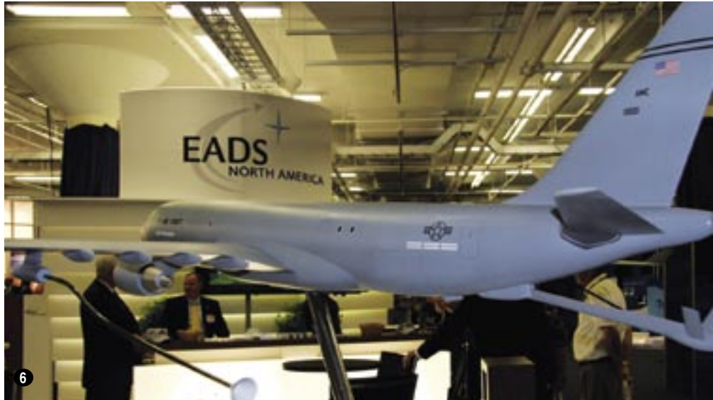
[5] An intertwined F-22 and F-35 form the centerpiece of Lockheed Martin's booth, underscoring USAF's stated position that both are needed. [6] A KC-30 tanker with boom and drogues deployed