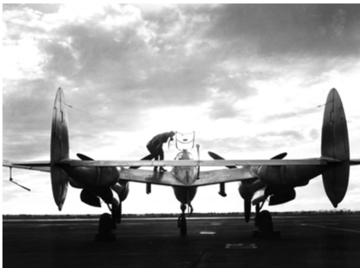
A P-38 in Chico, Calif., in 1944.

First US fighter to: destroy a German aircraft (1942), fly over Berlin (1944), land in Japan (1945) ★ solved torque problem with opposite-rotating propellers ★ "Lightning" bestowed by RAF ★ called "Fork-Tailed Devil" by Germans ★ appeared in the films "A Guy Named Joe" (1943), "Yamamoto Shot Down!" (1944), "Dick Bong: Pacific Ace" (1944) ★ led to F-4 and F-5 photorec variants ★ "made" more than 100 aces in the Pacific theater.