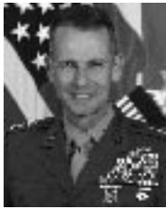
Chairman Gen. Peter Pace, USMC