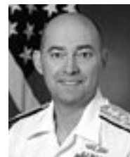
US Southern Command Adm. James G. Stavridis, USN