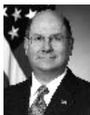
Secretary of the Navy Donald C. Winter