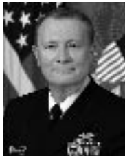
Vice Chairman Adm. Edmund P. Giambastiani Jr., USN