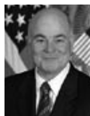
Secretary of the Army Francis J. Harvey