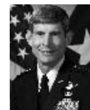
US Transportation Command Gen. Norton A. Schwartz, USAF