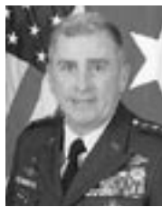
US Central Command Gen. John Abizaid, USA