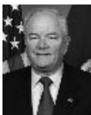
Secretary of the Air Force Michael W. Wynne