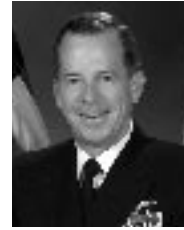
Chief of Naval Operations Adm. Michael G. Mullen