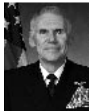
US Pacific Command Adm. William J. Fallon, USN