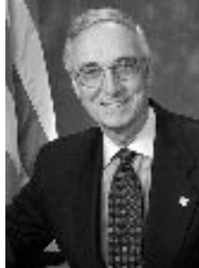
Deputy Secretary of Defense Gordon England