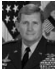
Army Chief of Staff Gen. Peter J. Schoomaker