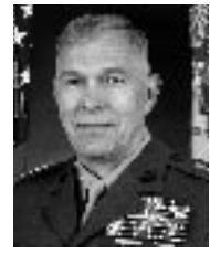
Commandant of the Marine Corps Gen. James T. Conway