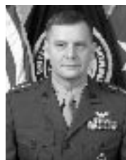
US Strategic Command Gen. James E. Cartwright, USMC