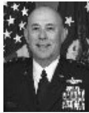
Air Force Chief of Staff Gen. T. Michael Moseley