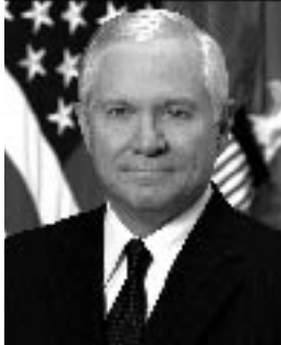
Secretary of Defense Robert M. Gates