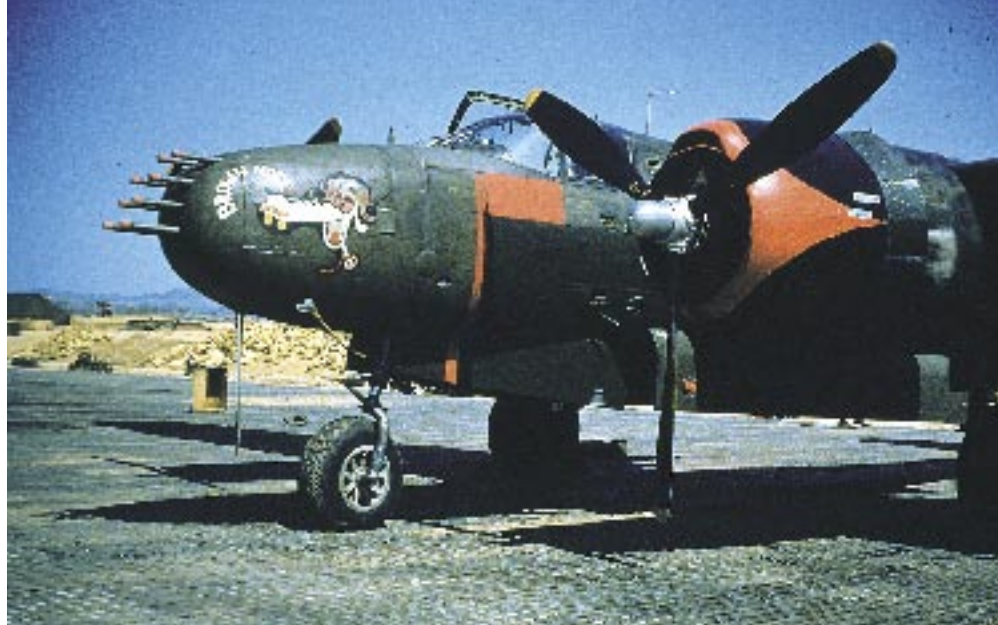
Counterclockwise from above: The 452nd BW Invader Brown Nose was an aircraft that stayed in Korea when the wing's personnel went home after a year. • The colorful B-29 My Assam Dragon III used artwork adapted from a World War II unit. • Kadena-based B-29 The Outlaw con-