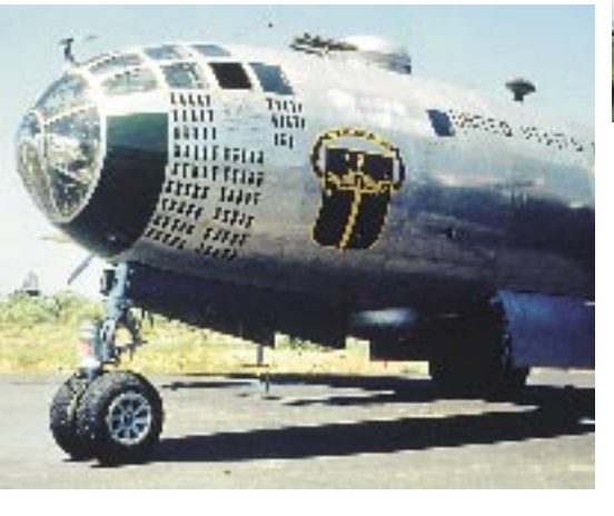
Counterclockwise from above: A B-29 of the 307th Bomb Wing, based at Kadena, shows the unit's distinctive "Box Y" tail marking; the wing was one of the war's longest-serving units. • The B-29 Mission Inn was one of the bombers that Strategic Air Command dispatched to Korea early in the war. • Another B-29 of the 19th BG shows off a huge number of mission markers.