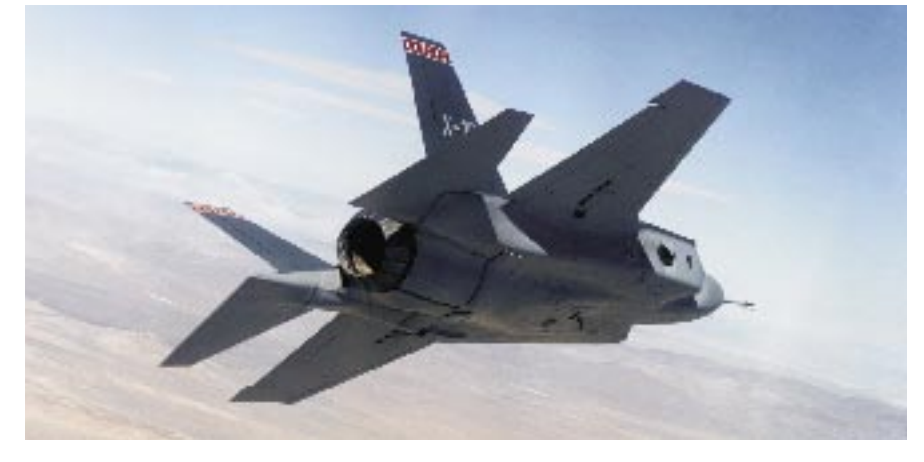
F-35 Joint Strike Fighter

Initial operational test and evaluation (IOT&E) examining the Raptor's air dominance mission concluded mid-September 2004. JDAM capability was demonstrated that same month. Follow-on OT&E (FOT&E) started in August 2005. The F-22A had achieved air-to-air and air-to-ground attack capability when it reached IOC in December 2005.