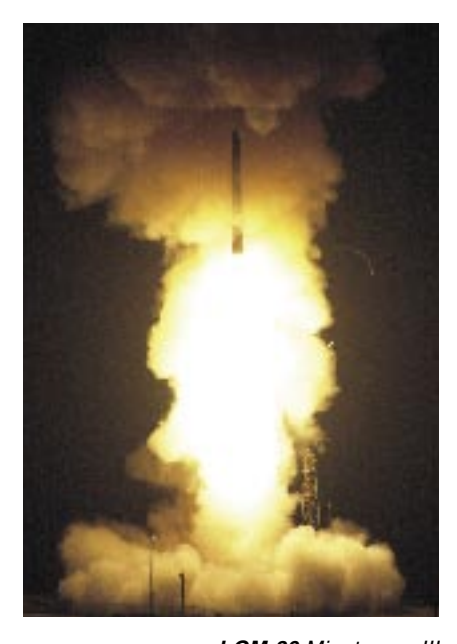
LGM-30 Minuteman III

Brief: Modified Bell helicopter used to support Air