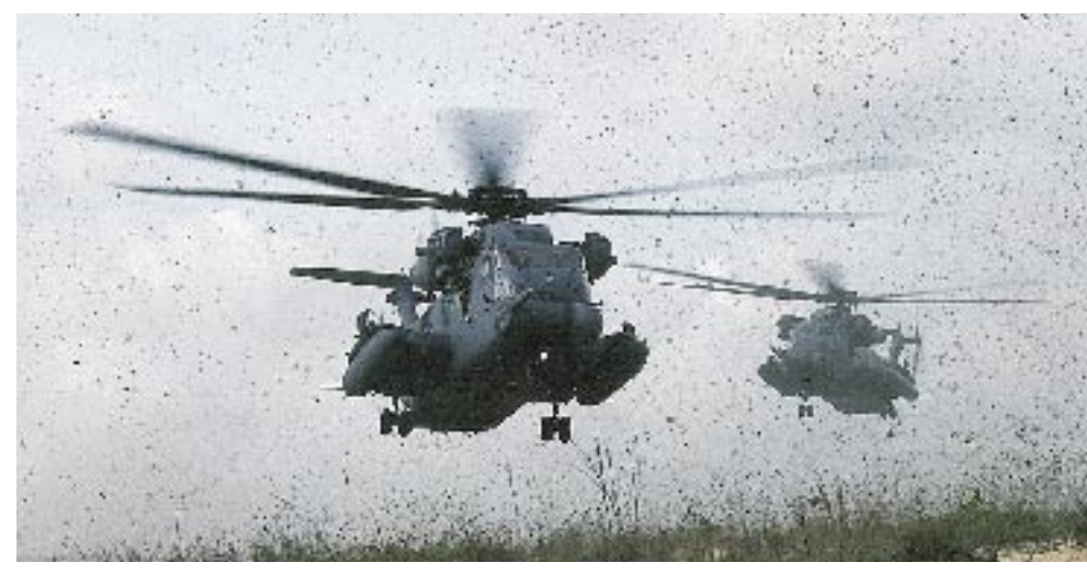
MH-53J Pave Low III

Brief: Modified utility transport used for parachute jump training. Function: Paradrop.