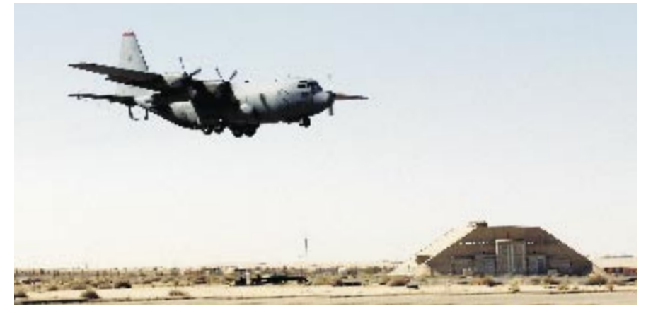
EC-130J Commando Solo II (Capt. Denise Boyd)

In early 2000, the E-4B entered the SDD phase of a modernization program aimed at updating the electronic infrastructure supporting the aircraft's primary mission