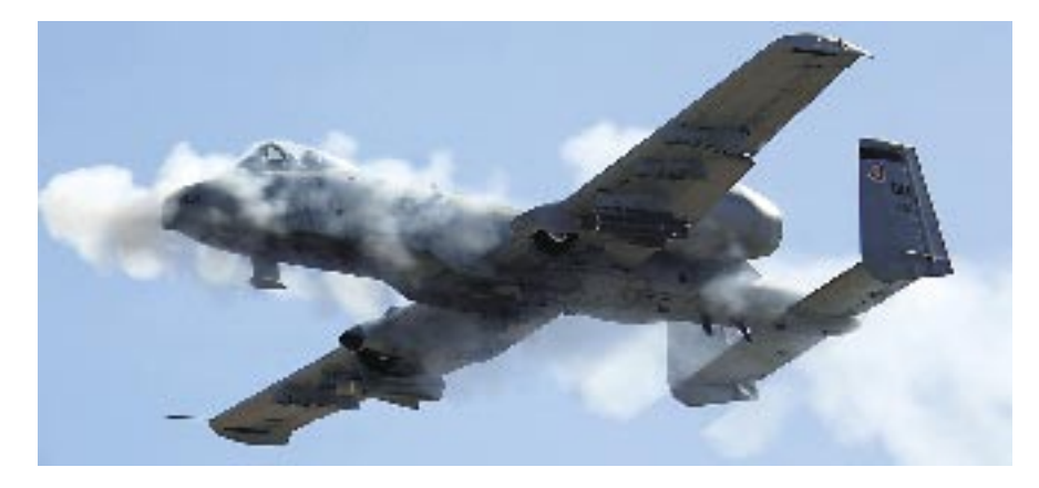
A-10A Thunderbolt II

pod capability as well as Rover. Aircraft designated OA-10A/C primarily are used for FAC(A), combat escort, CSAR, and visual reconnaissance missions. The OA-10 is identical to the A-10. Mission configurations typically include large weapons loads of white phosphorous marking rockets and covert/overt illumination rockets/flares to mark/illuminate targets for strike aircraft or friendly ground forces. The first OA-10 unit reached initial operational capability (IOC) in October 1987. All squadrons are now A/OA-10 mix configuration.