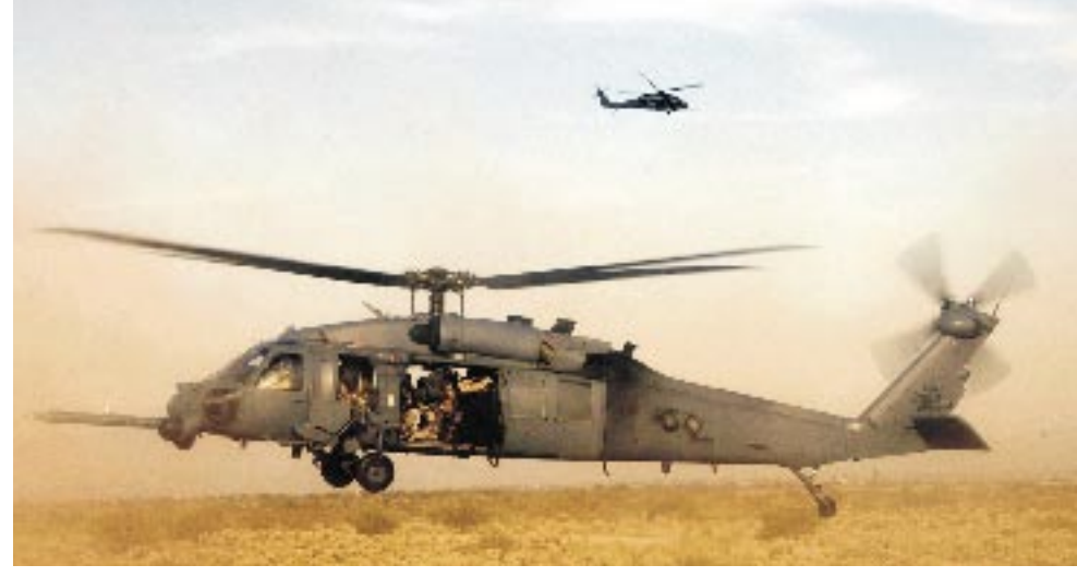
HH-60G Pave Hawk (A1C Veronica Pierce)

Function: Trainer. Operator: USAFA. Delivered: September 2002. IOC: December 2002. Production: 14. Inventory: 14. Unit Location: USAFA, Colo. Contractor: Grupo Aeromot, Brazil. Power Plant: one Rotax 912A, 81 hp engine.