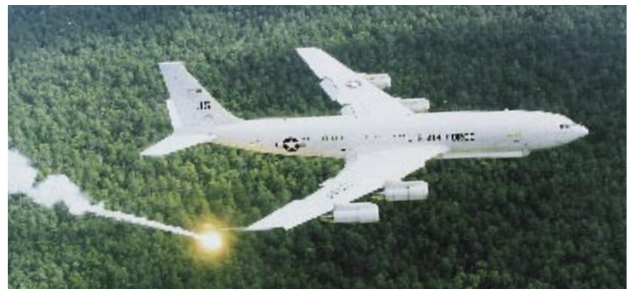
E-8C Joint STARS

Brief: A modified Boeing 707 equipped with a large, canoe-shaped radome mounted under the forward part