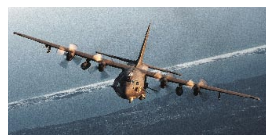
AC-130 Gunship

First Flight: July 27, 1972. Delivered: November 1974-85. IOC: September 1975. Production: 874.