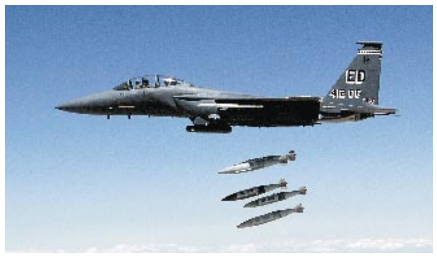
GBU-31 Joint Direct Attack Munition

The Advanced Extremely High Frequency (AEHF) system comprises three satellites in geosynchronous orbit that provide at least 10 times the capacity of the 1990s-era Milstar Block II satellites. Advanced EHF allows the President. Secretary of Defense, and combat forces to control their tactical and strategic forces at all levels of conflict