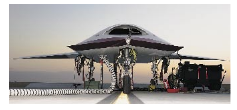
J-UCAS: X-45A UCAV concept demonstrator

Brief: The prototype YAL-1A, using a modified 747-400F platform, will be the world's first operational airborne