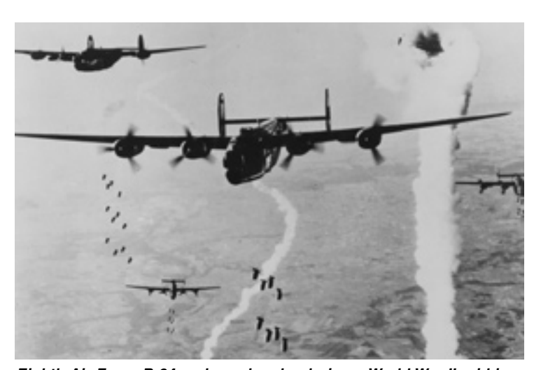
Eighth Air Force B-24s release bombs during a World War II raid in the vicinity of Tours, France.

Went from contract award to first flight in 9 months \star 55 variants \star 1,713 lost in training \star B-24 Lady Be Good missing for 16 years, until wreckage found in Sahara \star refueled B-17 in tests \star five Medals of Honor to B-24 airmen in Ploesti raid, most of any USAAF action \star C-87 variant was to be first Presidential aircraft, but it was never used \star credited with 72 U-boat kills.