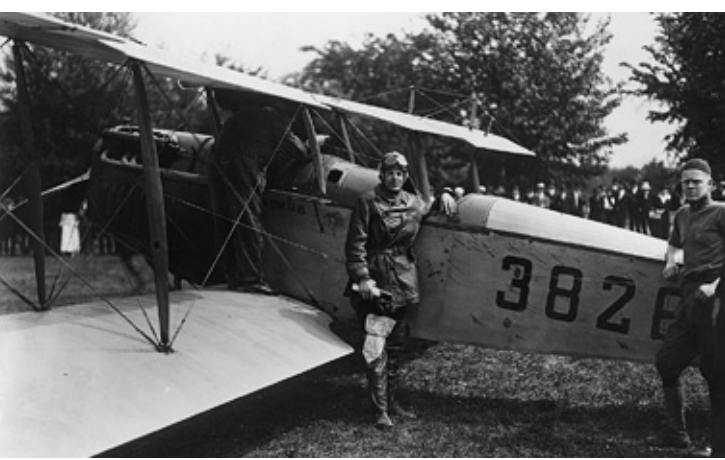
Maj. Rueben Fleet (left) after 1918 airmail run in JN-4H.

Nicknamed "Canuck" (Canadian JN-4) \star sold in postwar civilian market for as little as $50 each \star JN-3 deployed in 1916 to Mexico for aerial observation in Pershing's punitive expedition against Pancho Villa \star fitted with bomb racks, machine guns, and cameras in later models \star pictured on now-valuable "inverted Jenny" 1918 air mail stamp \star used on rare occasions as ambulance aircraft \star picked up name "Jenny" from JN, a simple combination of the two designations "J" and "N" given to earlier aircraft.