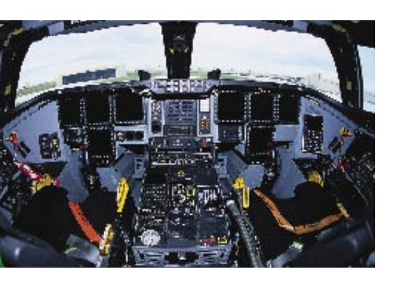
Above is a view from the rear of a B-2 cockpit, with its two crew positions. Despite the cramped quarters, B-2 pilots regularly fly missions lasting 20 hours or longer, and there is room for a pilot to lay down and rest during a mission.

Each B-2 staged three or four seven-hour sorties per week, and each pilot flew about three sorties per month. In addition, PACAF sent the stealth bombers on longer global power sorties. Below, Tibbets and Bailey (in flight suits) review a mission with two maintainers under the B-2 Spirit of California.