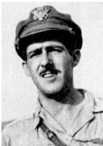
Maj. Thomas McGuire Jr. (38)