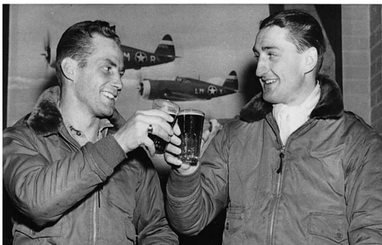
Capt. Robert Johnson (27) and Lt. Col. Francis Gabreski (28)