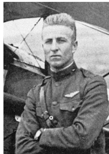
2nd Lt. Frank Luke Jr. (18)