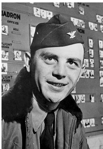
Col. Hubert Zemke (17.75)