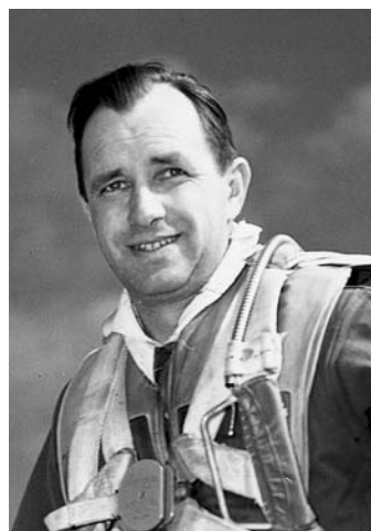
Lt. Col. Harrison Thyng (5)