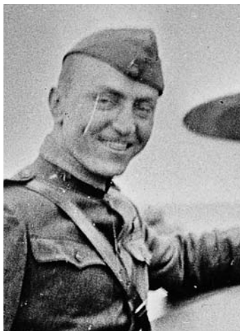
Capt. Eddie Rickenbacker (26)