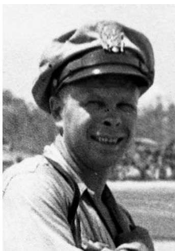
Maj. Richard Bong (40)

Ranks are as of last victory in World War II.