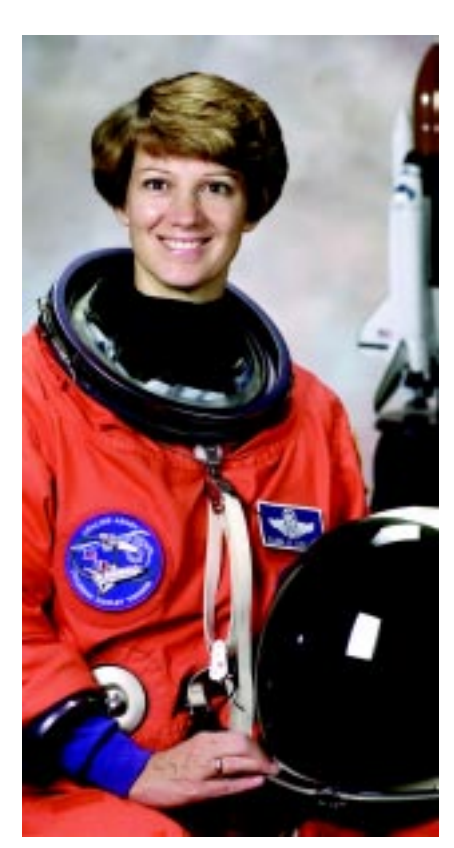
Lt. Col. Eileen Collins, first woman to pilot a US spaceship and first female to command a space shuttle.

Oct. 1, 2001. Control of the Space and Missile Systems Center, Los Angeles AFB, Calif., shifts from Air Force