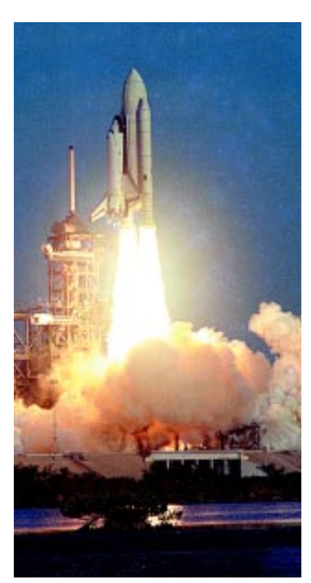
The launch of the first flight of space shuttle Columbia lifts off from Cape Canaveral, Fla.

enter new phase of program to develop a workable ASAT weapon. A two-stage ASAT missile, launched from an F-15, would send a miniature kill vehicle smashing into a satellite target.