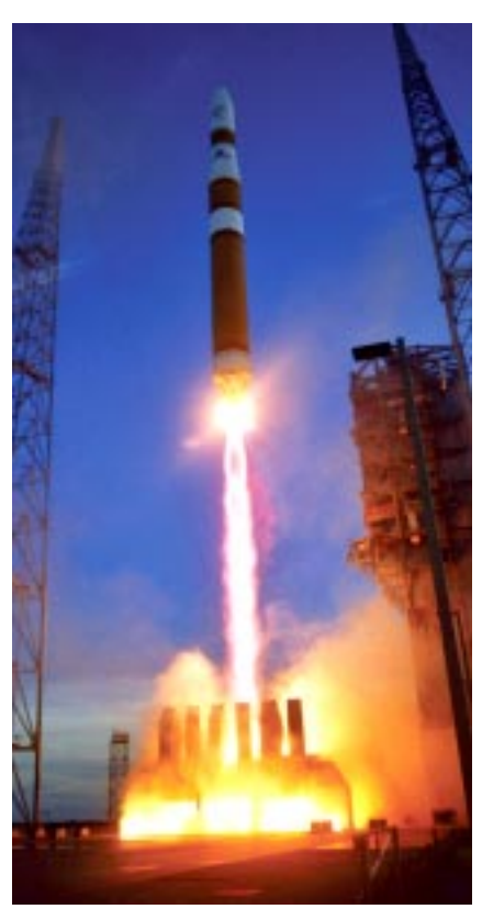
A Delta IV rocket lifts off from Cape Canaveral, Fla., carrying a DSCS satellite.

Materiel Command to Air Force Space Command, thereby placing cradle-tograve oversight of acquisition and operation of space systems under a single command.