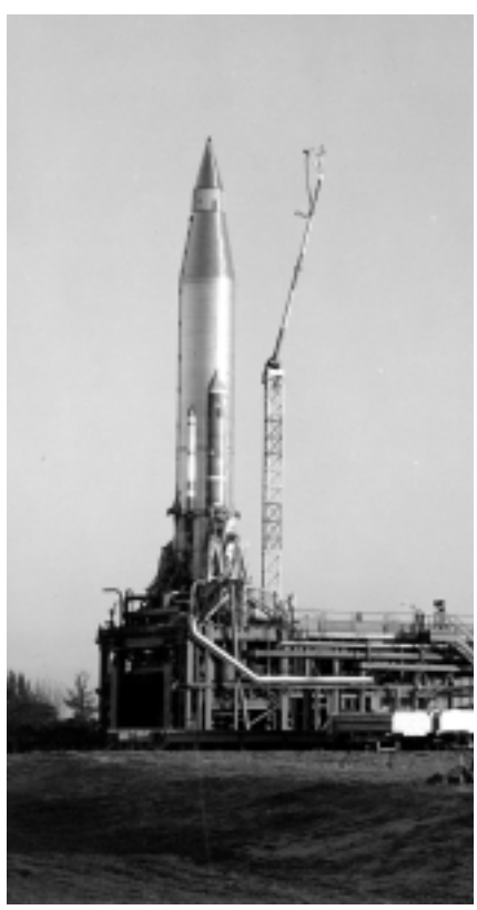
An Atlas booster fitted with a communications repeater satellite waits on the pad at Patrick AFB, Fla.

Sept. 23, 1959. DOD states that primary responsibility for military space programs belongs to the Air Force.