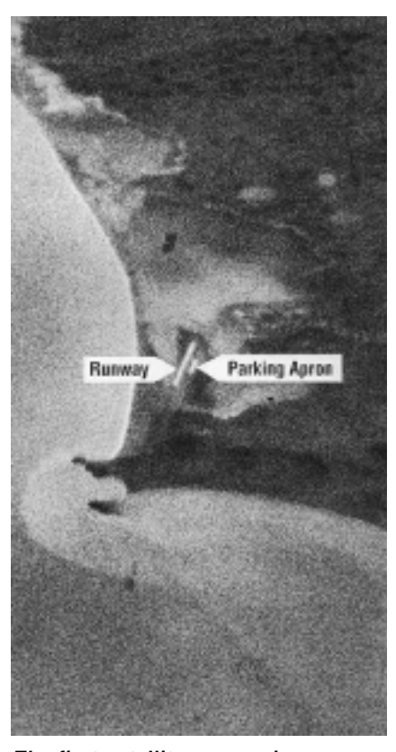
The first satellite reconnaissance photo of Soviet territory, taken in 1960 by Discoverer/Corona.

Feb. 1, 1961. First LGM-30A Minuteman ICBM is test launched from