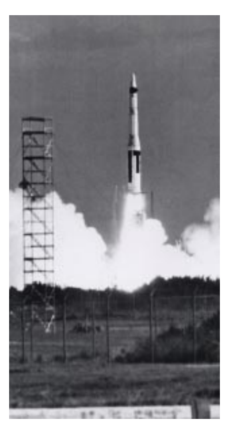
The first Minuteman LGM-30A is test launched at Patrick AFB, Fla. The test is successful.

Aug. 19, 1964. Thor/Delta vehicle boosts into orbit NASA's Syncom 2 communications spacecraft, the world's first geosynchronous satellite, which then carries communications between Clark AB, the Philippines, and Camp Roberts, Calif.