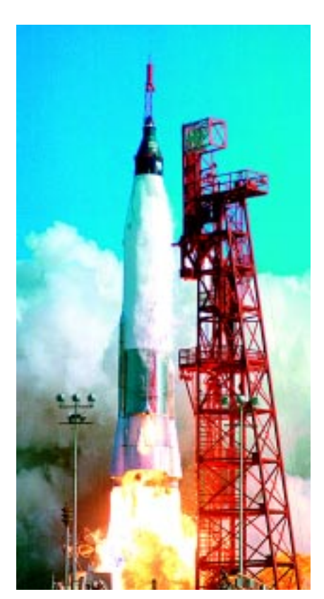
Launch of Friendship 7. There was great synergy between US military and civil space efforts.

July 15, 1964. Secretary McNamara directs DOD to begin full development of Initial Defense Communications Satellite Program.