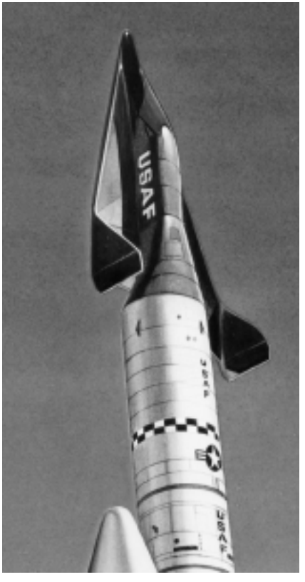
USAF's X-20 Dyna-Soar boost-glide space vehicle. This was the first step toward a usable space shuttle.

December 1958. ARDC assumes space track mission for the Air Force.